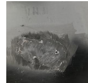
Hole & surface repair