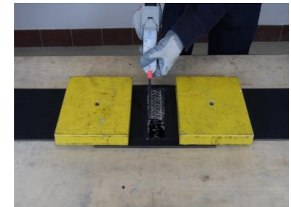
Seal belt fasteners