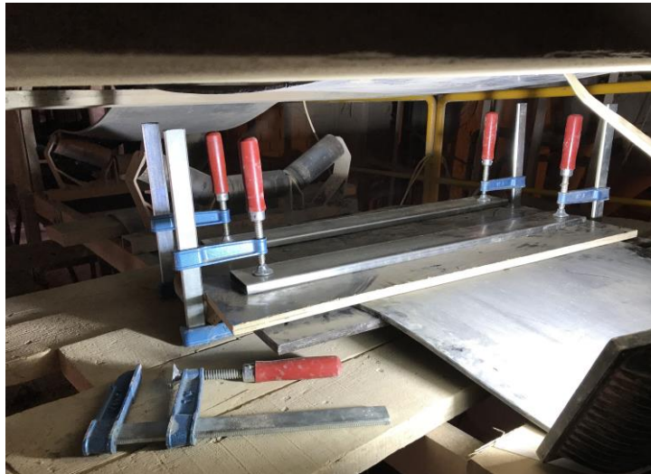
Step splicing of multiply belts