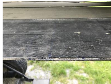
Step splice on baler belt (90 mm pulley)