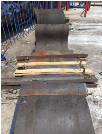
Finger splicing of monopley belts