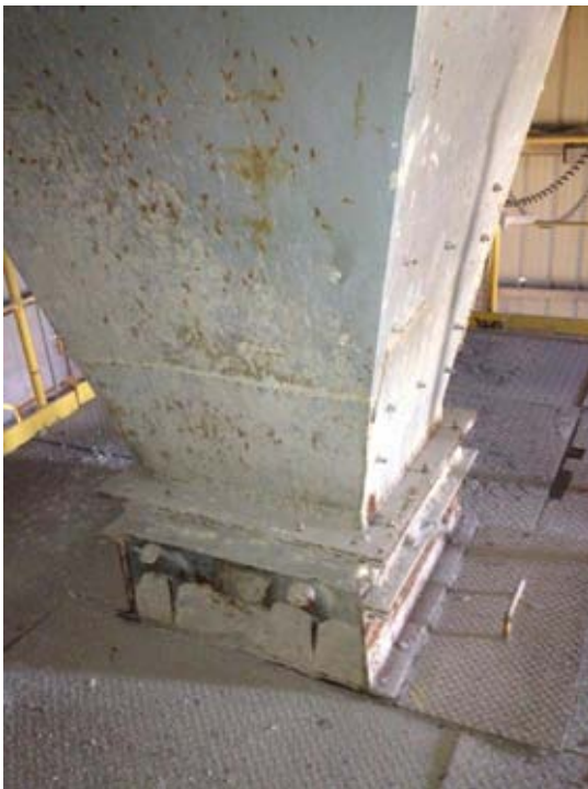
f) Feeding device

The feeding device is NOT the typical Polysius design (manual adjustable chute side walls in combination with hydraulic adjustable, angles shut of plates) but is a simple, non-adjustable chute that also cannot be shut off for a non-load start of the main motors.