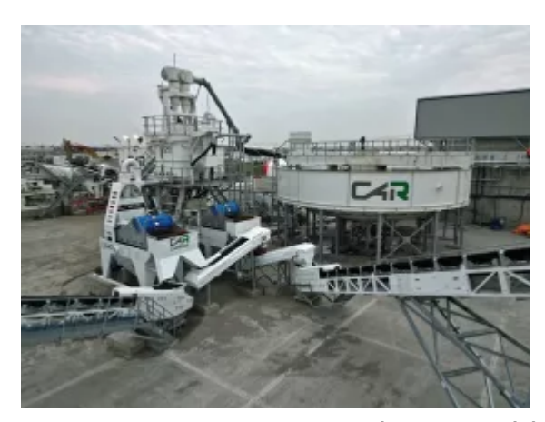
CDE's new 250 tons per hour washing solution at CAR's recently commissioned recycling facility.

Recently commissioned at CAR's recycling facility in south east Calgary, the new 250 tons per hour (tph) washing solution, designed and engineered by CDE, will take centre stage on Thursday 7th September 2023 as industry representatives gather to learn more about CDE's innovative recycling process and the positive impact its technology is having on resource availability in the Calgary and Alberta areas.