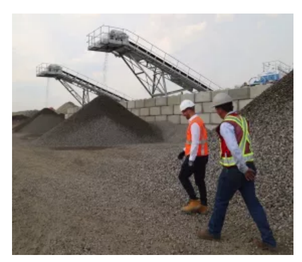
Washed aggregate stockpiles.

Processing up to 250tph of raw feed material, the CDE solution is transforming C&D waste into a high value suite of construction products, helping CAR to generate additional revenue while simultaneously diverting significant tonnages of material from landfill.