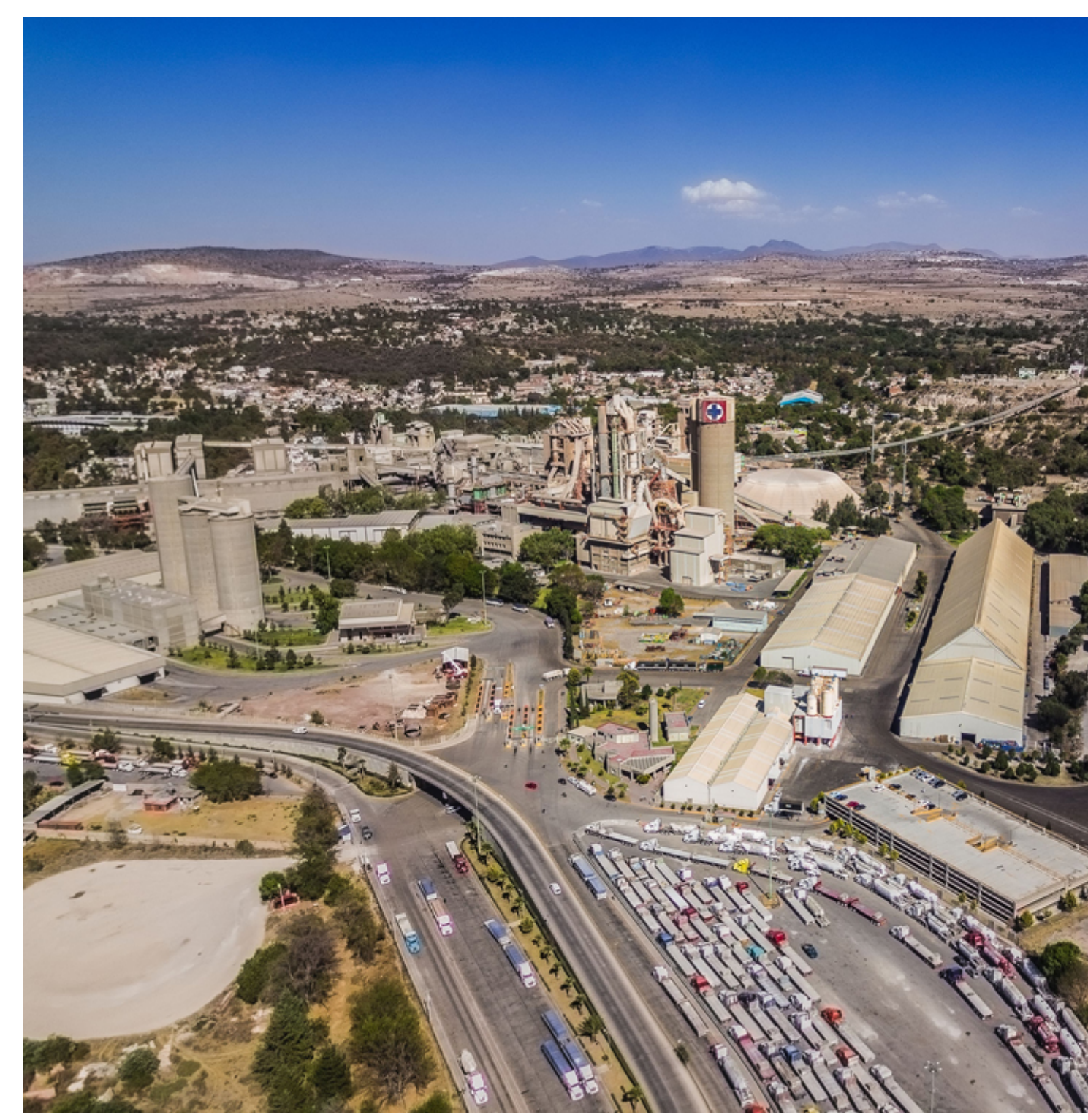
Picture 1: One of the sites of the Cooperative La Cruz Azul is in Hidalgo. Some of the newest products of the cement manufacturer are eight different types of a new tile mortar.

Gigantic bridges, high-rises, tunnels for roads, subways and sewage systems: some of biggest construction projects in Latin America are currently being built in Mexico. This makes the country the second largest cement market on the