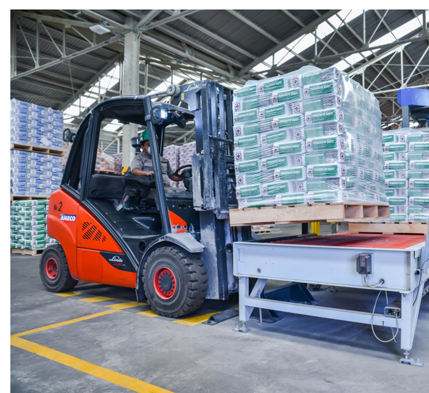
Picture 10: Picking up the palletised and packaged products with a fork-lift truck and delivering them to the outgoing goods.

In June 2016, Cruz Azul put the line into operation. "The new BEUMER packing line brought the project to success," mentiones Victor Luna . Which means that the cement manufacturer can reach its projected production capacity. In order to ensure a trouble-free operation, the system supplier's competent specialists stay in close touch with the customer and help out immediately in case of malfunctions or downtimes. BEUMER Group also provided the necessary spare parts. Ensuring high availability of the systems at all times.