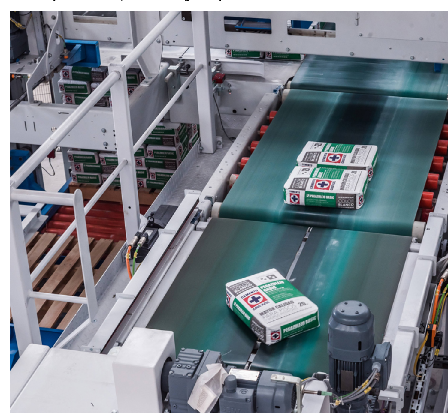
Picture 7: The twin-belt turning device accurately positions the bags quickly and gently.

move the bags without mechanically deforming them: two parallel driven belt conveyors move at different speeds and turn the bags quickly into the desired position. The intelligent control of the twin-belt turning device also takes the dimension and weight of the filled bag into consideration. Exact positioning, specified by the preset packing pattern, is achieved. "No adjustement is necessary even with a product change," says Buchholz .