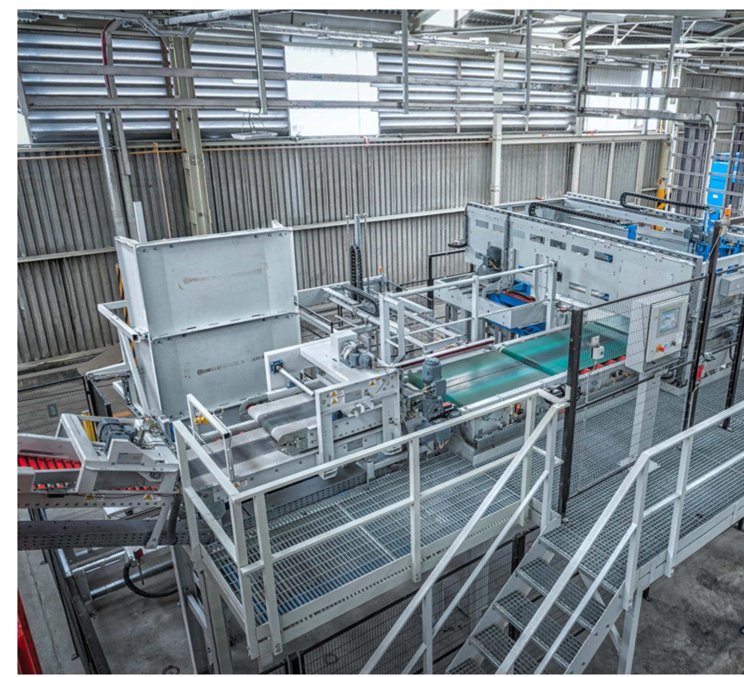
Picture 6: The packaging line operates around the clock. Which means that the cement manufacturer can reach its projected production capacity.

For the subsequent fully automatic, reliable and most of all fast palletising, BEUMER Group installed a BEUMER paletpac layer palletiser . Per hour, it gently and reliably stacks 2,200 bags per hour in 10-bag patterns or in 8-bag patterns on pallets of 1,220 x 1,020 x 245 millimetres in size. "A twin-belt turning device brings the bags in the required, dimensionally stable position," explains Buchholz . The position accuracy of this device offers a great advantage compared to conventional turning machines, because the system's components