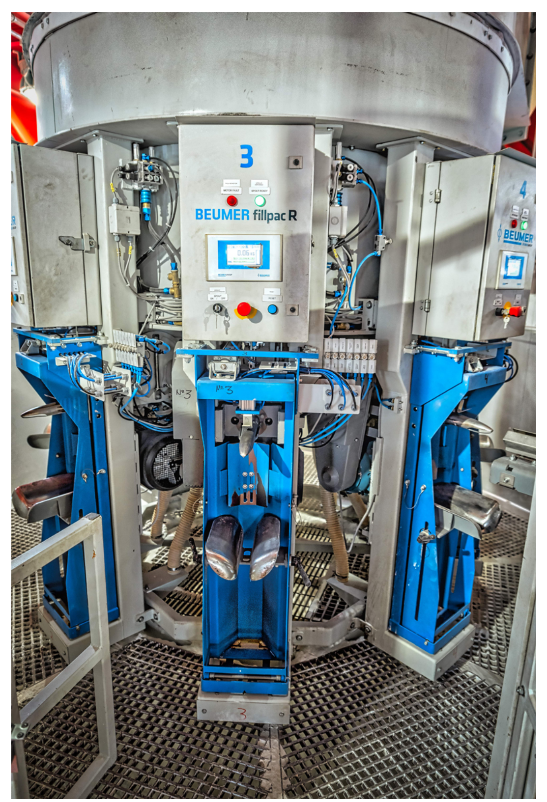
Picture 3: BEUMER Group supplies everything from one single source. This includes the BEUMER fillpac filling system. It can be adjusted to the changing parameters of the different materials.