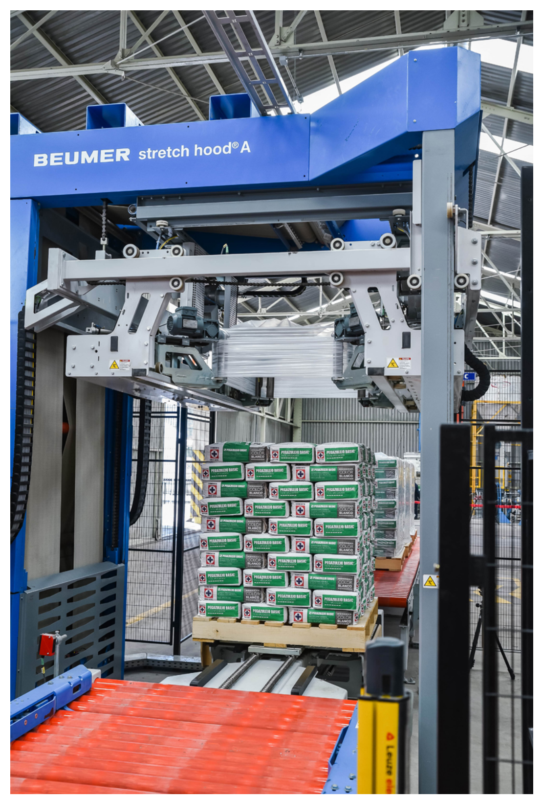
Picture 9: The BEUMER stretch hood A packages the bag stacks with a stretch film hood. This protects the product against damage during transportation and atmospheric influences.