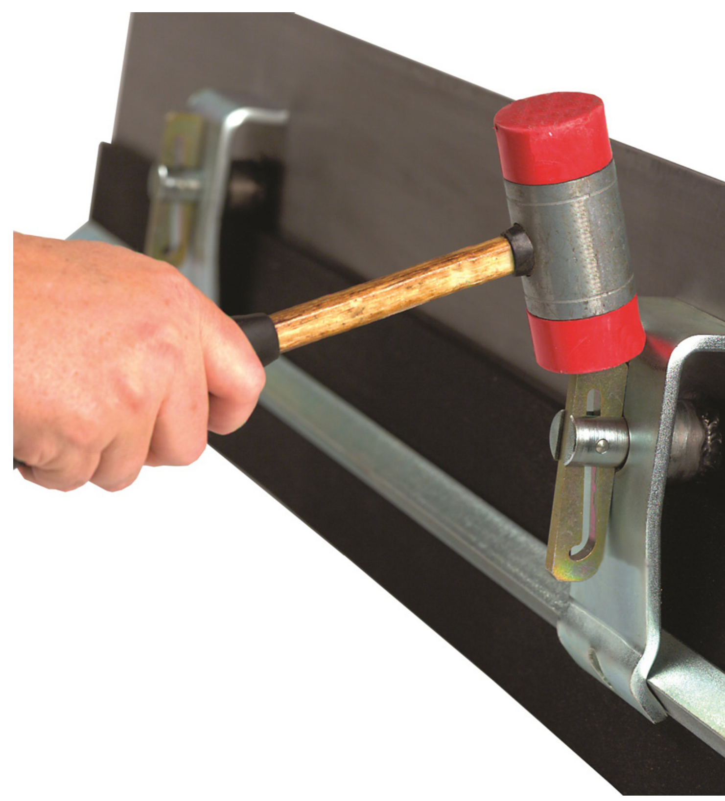
Photo 1: Flexco supplies Flex-Lok skirt clamps for a wide range of load levels. They can be easily installed by one person.

The Flex-Seal skirting system is a dynamic containment unit which completely seals the loading zone parallel to the belt. The system reduces dust levels by