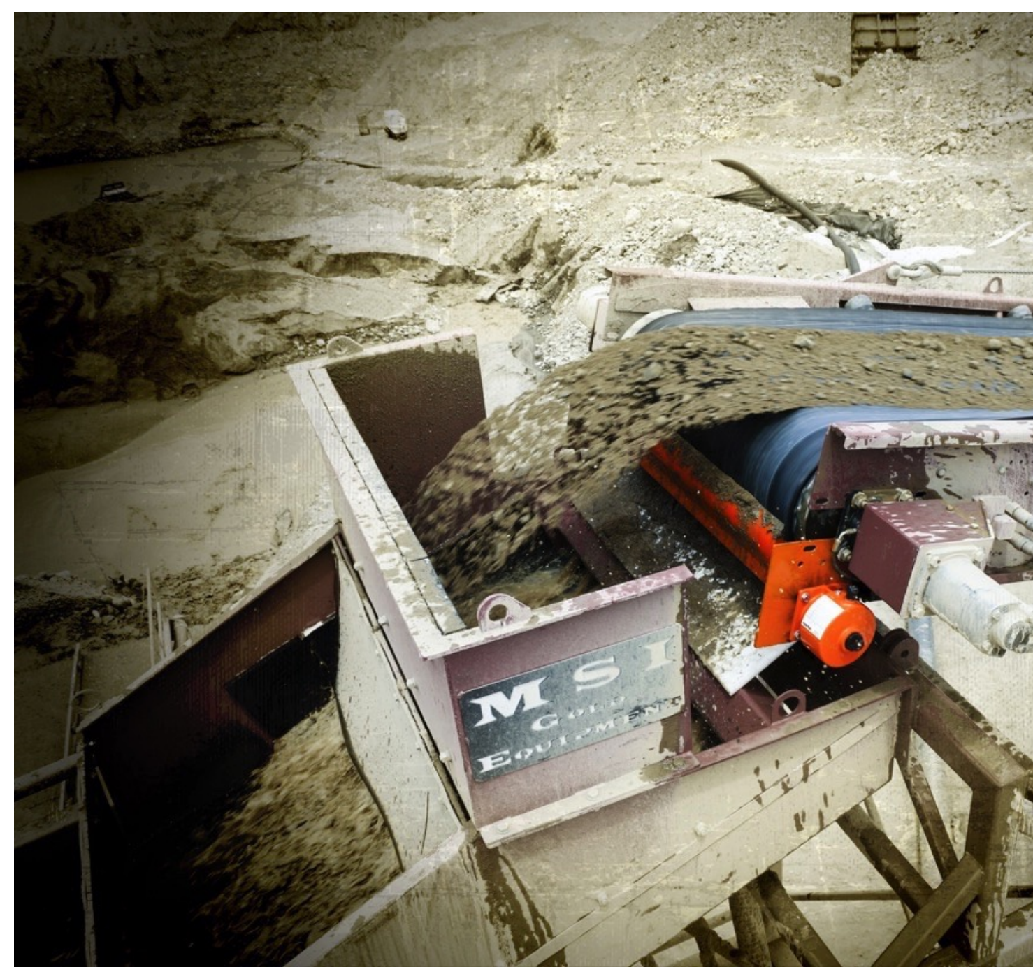
The heavy-duty primary belt cleaner can be replaced safely by one person

I've seen in my 20 years of mining. But it's been in service for six months without us having to touch it. And the cleaning performance is great."For the wet conveyor, the Martin technicians selected a heavy-duty primary belt cleaner that features unique technology to maintain the most efficient cleaning angle throughout its service life. Equally important given the time constraints of the competition, the blade features a no-tool replacement process that can be performed safely by one person in less than five minutes. For the secondary cleaner, a rugged design with individually-cushioned tungsten carbide blades was installed to withstand the punishing conditions.