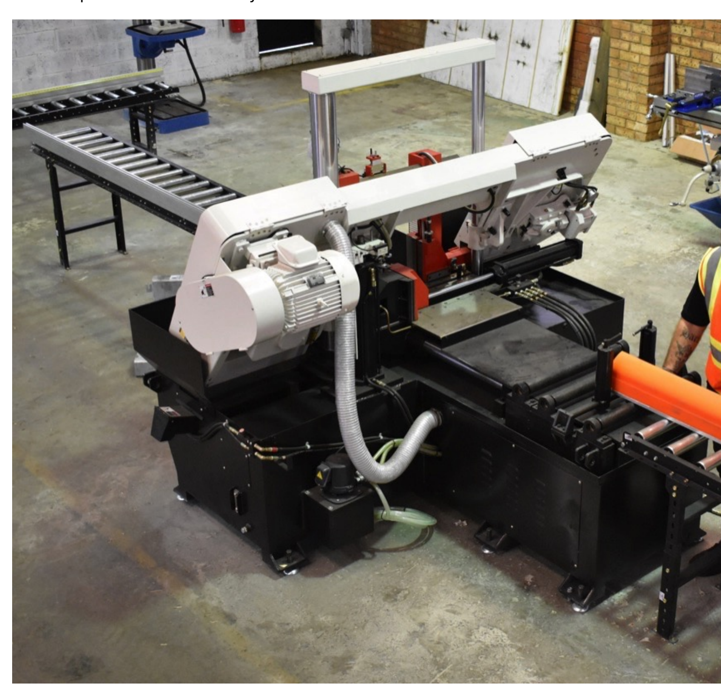
A finished belt cleaner blade is cut to length.

customers receive blades with the same quality and guaranteed performance, regardless of their location. Partnering with BASF brings the benefit of the chemical company's extensive and reliable supply chain, allowing Martin Engineering to continue innovating polyurethane blade production and quickly deliver products worldwide. Further, the global pricing agreement in place between the two companies means customers will see an uncommon consistency in blade price from one country to another.