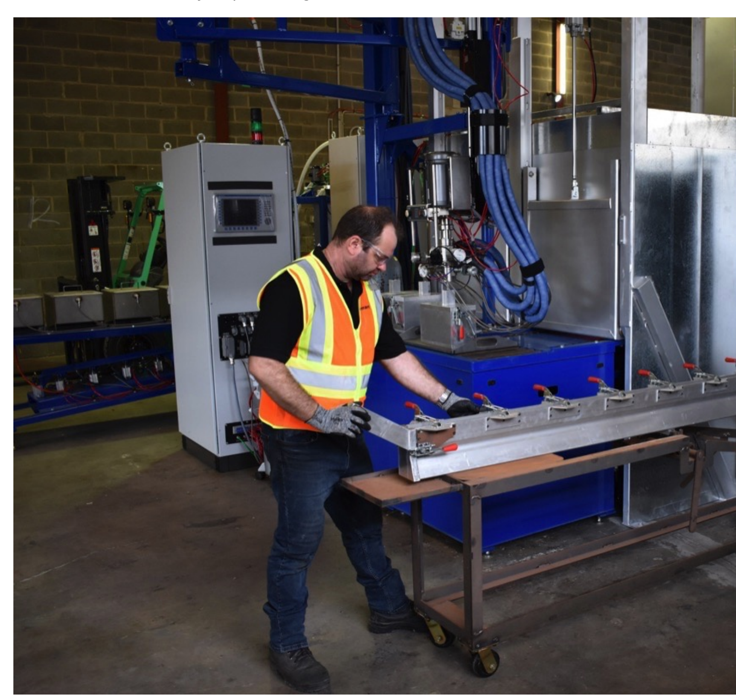
A urethane-filled mold is loaded into the curing oven.

manufacturing cells are designed, engineered and constructed by Martin, and the unique processing technology is being implemented at Martin locations on six continents to deliver premium-quality components around the world with unrivalled consistency and wear life. The system is believed to be the only one of its kind dedicated solely to producing belt cleaner blades.