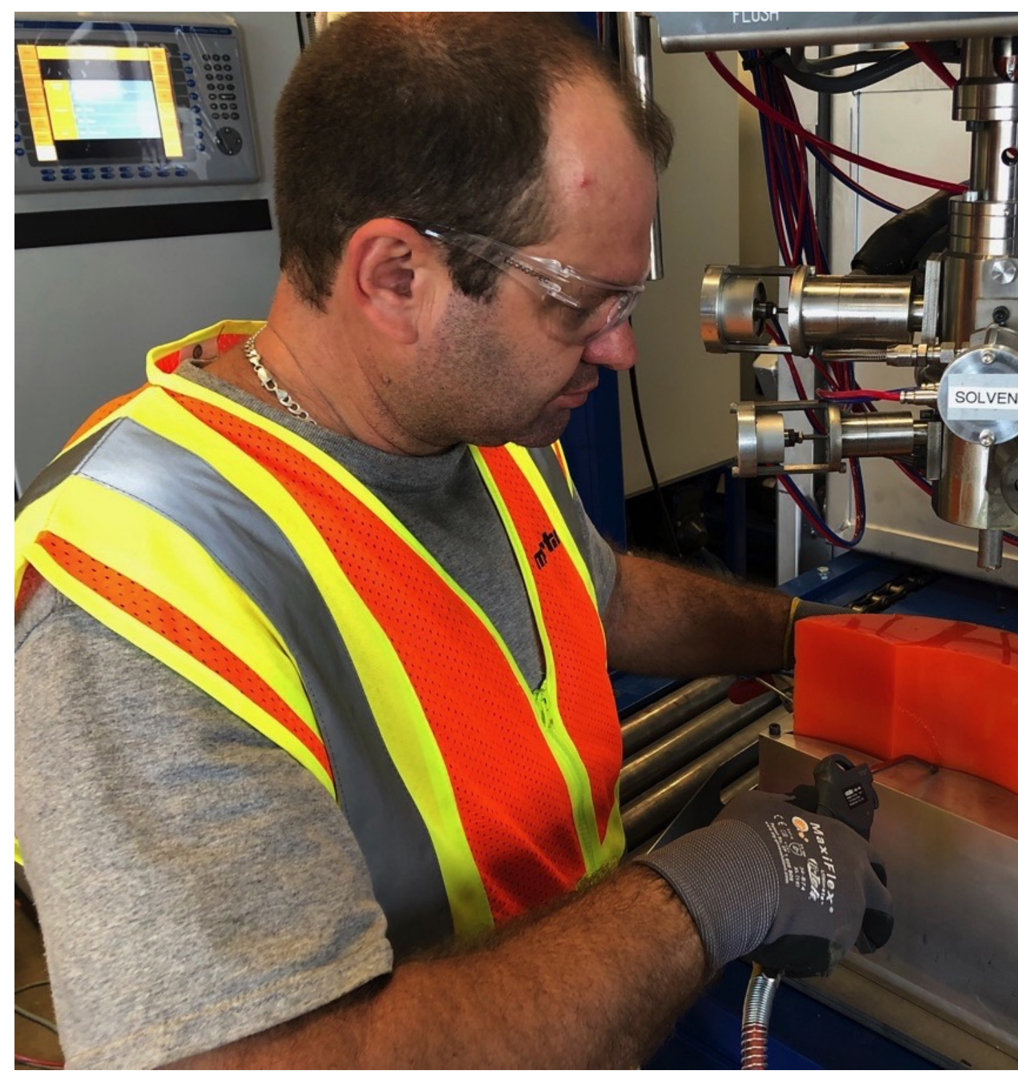
Conveyor belt cleaner blades will be manufactured using Martin's proprietary molding technology.

Company officials say that having local production will also allow Martin Engineering to supply its products at lower prices, reducing the overall cost of ownership. Among the manufacturing capabilities are the firm's proprietary technology for producing belt cleaner blades, using its custom-built work cell. The