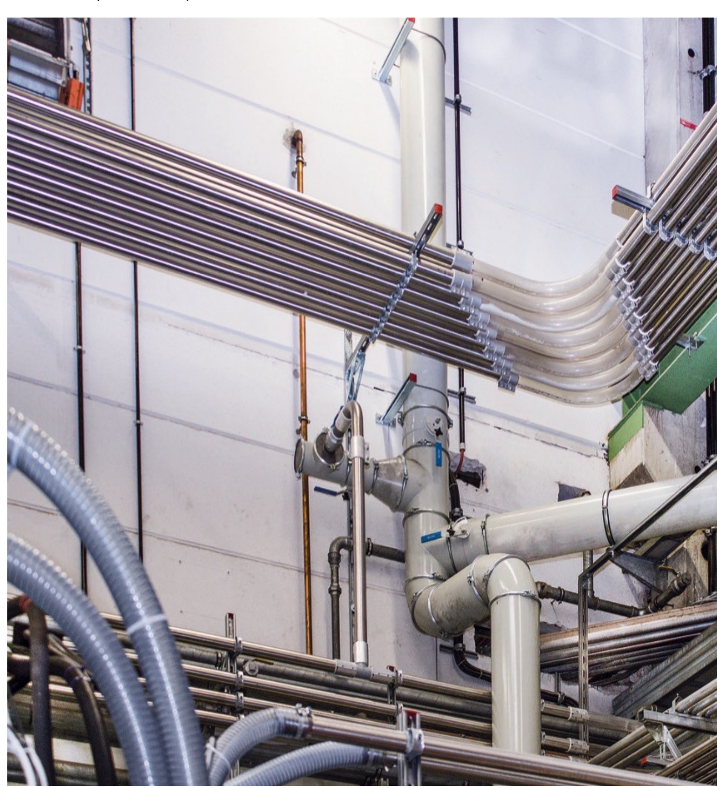
Shut-off valves were installed at strategically important points In order

as the connection of additional machines. Numerous shut-off valves were installed at strategically important points in order to be prepared for future expansion measures at the central vacuum system. This will facilitate a better separation of the individual areas of the vacuum in the future without impairing the overall production process.