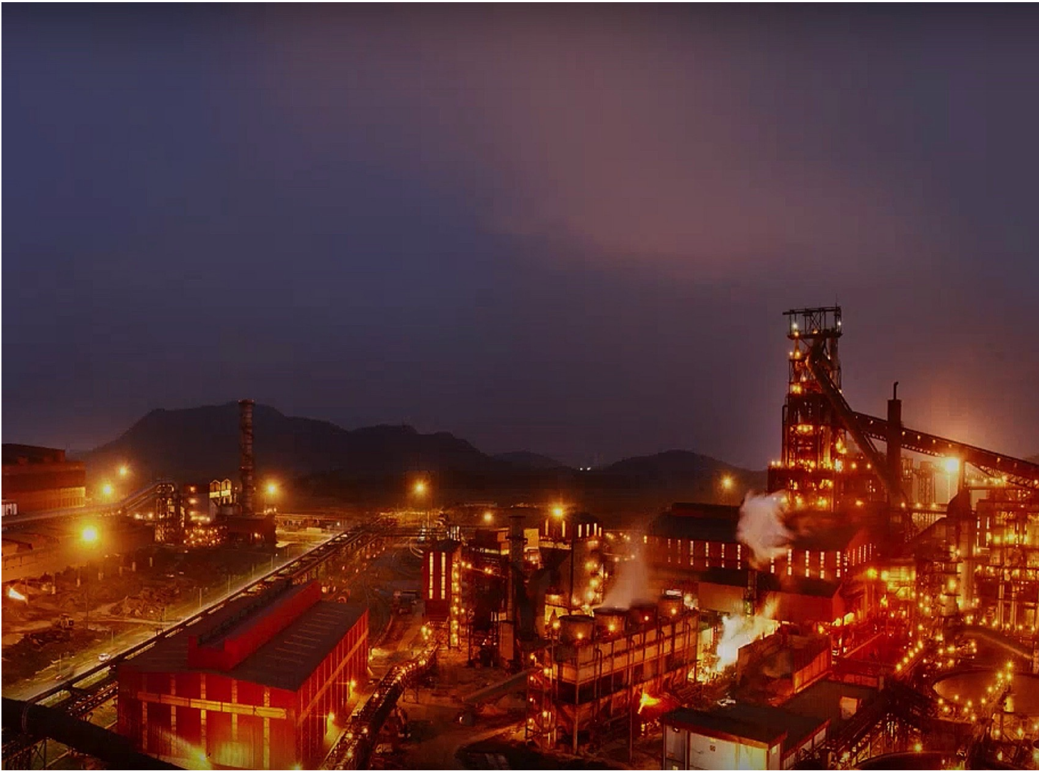
The Tata Steel facility in Kalinga Nagar, Odisha.

Located near the East Central coast of India in the State of Odisha, Tata Steel, one of the country's largest steel producers, expanded upon the plant originally envisaged in 2004. In 2015, it increased the facility's production capacity to 3 million tonnes (5.5 mil. s/t) annually, taking the company's total domestic steel output to 13 million tonnes (19.5 mil. s/t) per year. The expansion was also intended to benefit the largely underdeveloped Kalinga Nagar inland tribal area that was in need of employment, skills training and resources. Considered one of the fastest growing economies in the country, Odisha is attractive to both domestic and foreign investment, with growing urban areas along its extensive coastline. However, due to its relative isolation, the inland population had not yet caught up to the rapidly advancing urban culture. Dedicated to the principals of a safe workplace, the collaborative effort offers local hires structured and intensive training on bulk material handling, since few had access to vocational education and many had never seen a conveyor before. Having provided advanced training at Tata's Jamshedpur facility in 2015, the steel producer partnered with Martin