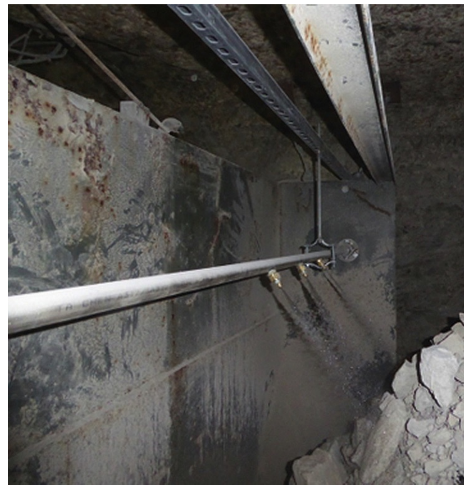
The dust management system treats the material from the top and bottom during discharge.

A 6-nozzle cradle-mount system was installed to provide serviceability at the Conveyor 1 discharge, and a manifold system was placed to address the issues at the dump pocket. Material monitoring sensors were employed at both locations to ensure application only when needed.