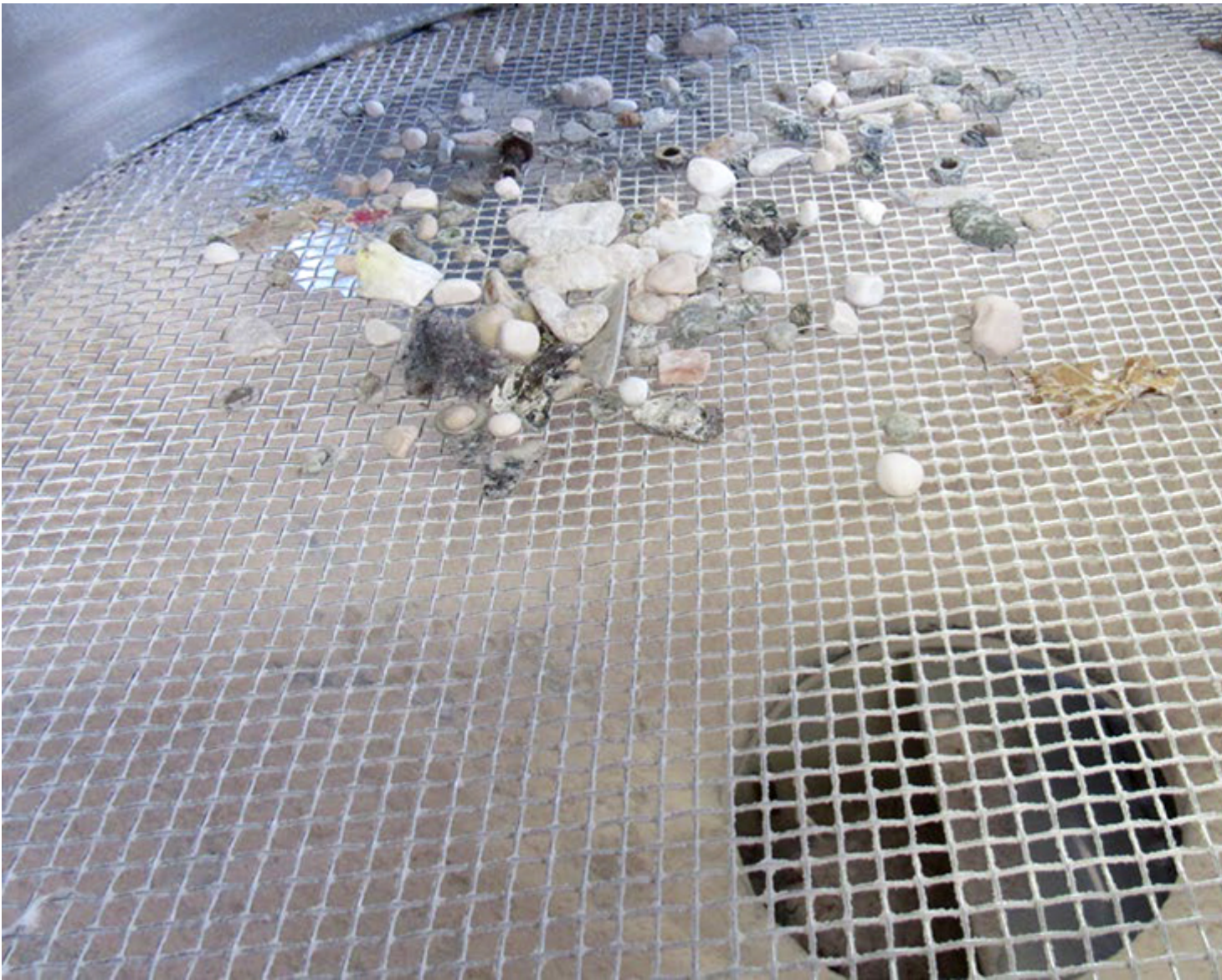
Figure 3. The Russell Compact Sieve ® removes contamination from aluminium hydrate powders, protecting chemical processing equipment.

conveying and loading areas, providing a compact solution to screening incoming materials. The unit was installed as part of the conveyor system from the dry bulk tanker to the reactor and is used to screen up to 48 tonnes of incoming aluminium hydrate per day and protect downstream equipment from foreign contamination. Sparks continued, "We are delighted with how the Russell Finex sieve has performed since it was installed. It has been invaluable in checking incoming materials, meaning we've experienced virtually no problems with contamination and damage to our equipment. The unit is used all day, every day and has exceeded our expectations regarding durability."