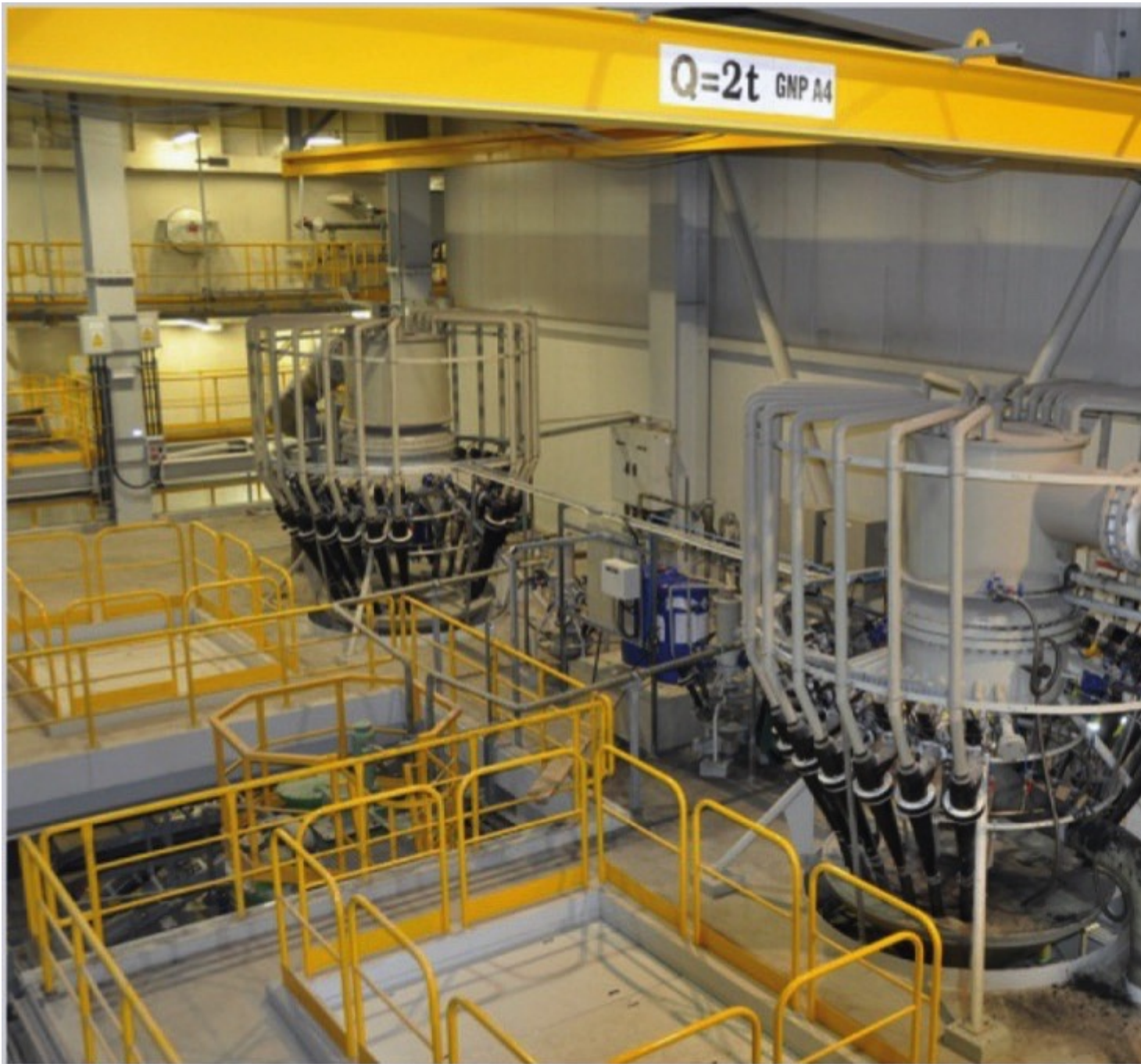
FGD gypsum dewatering system in Belchatov, Poland.