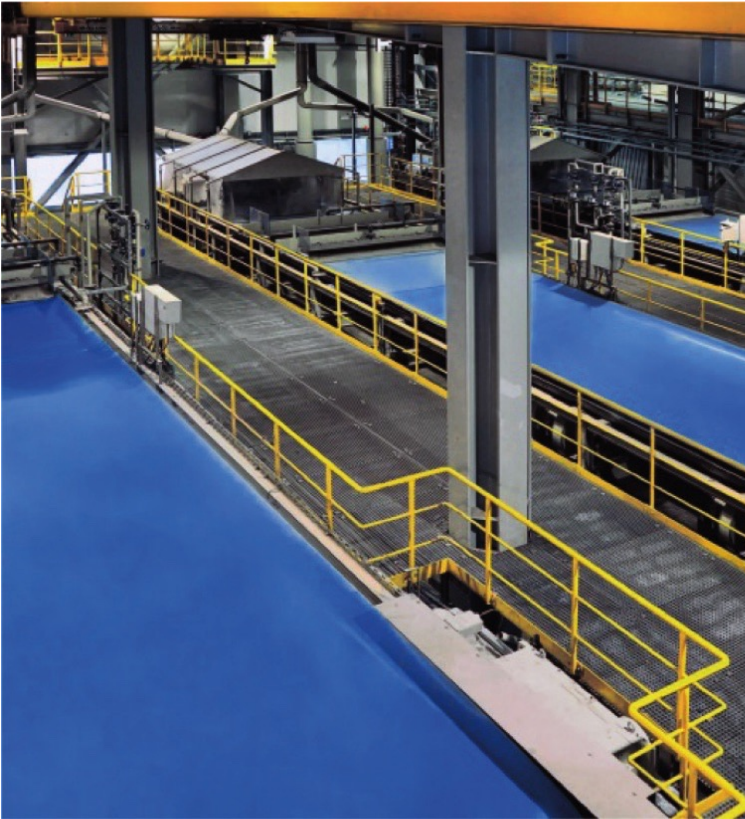
GKD Vacubelt filter belts, installed in the Belchatov FGD gypsum dewatering system.