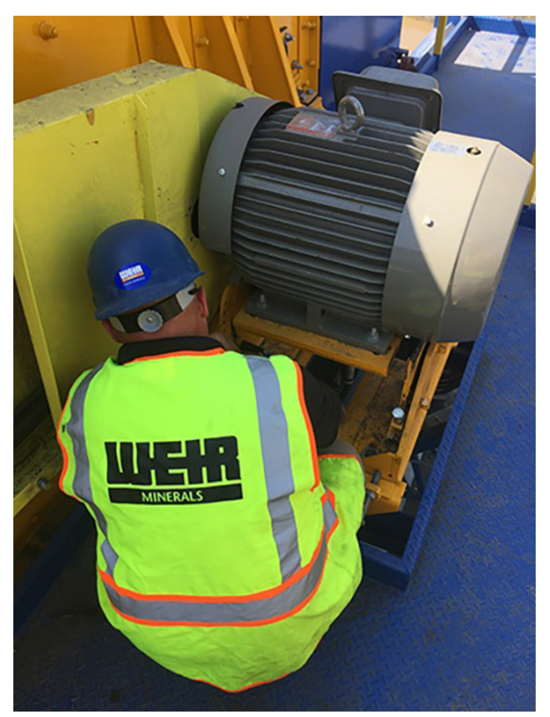
Skilled service technicians will help to create a well tuned maintenance plan.

Whilst wear replacement is a necessary feature of any crushing operation, there are steps you can take to extend the service life of crusher wear parts. Always ensure the wear parts are fastened into the machine properly. With jaw crushers, if you allow the jaw dies to move during operation they can cause damage to the frame of the jaw crusher. Similarly, loose liners in cone crushers may damage the head or bowl. It is also advisable that operators frequently look for holes, cracks, or flat spots, which could potentially damage the machine long term or be an indication of another issue. Further to that, you should track tonnages. As cone