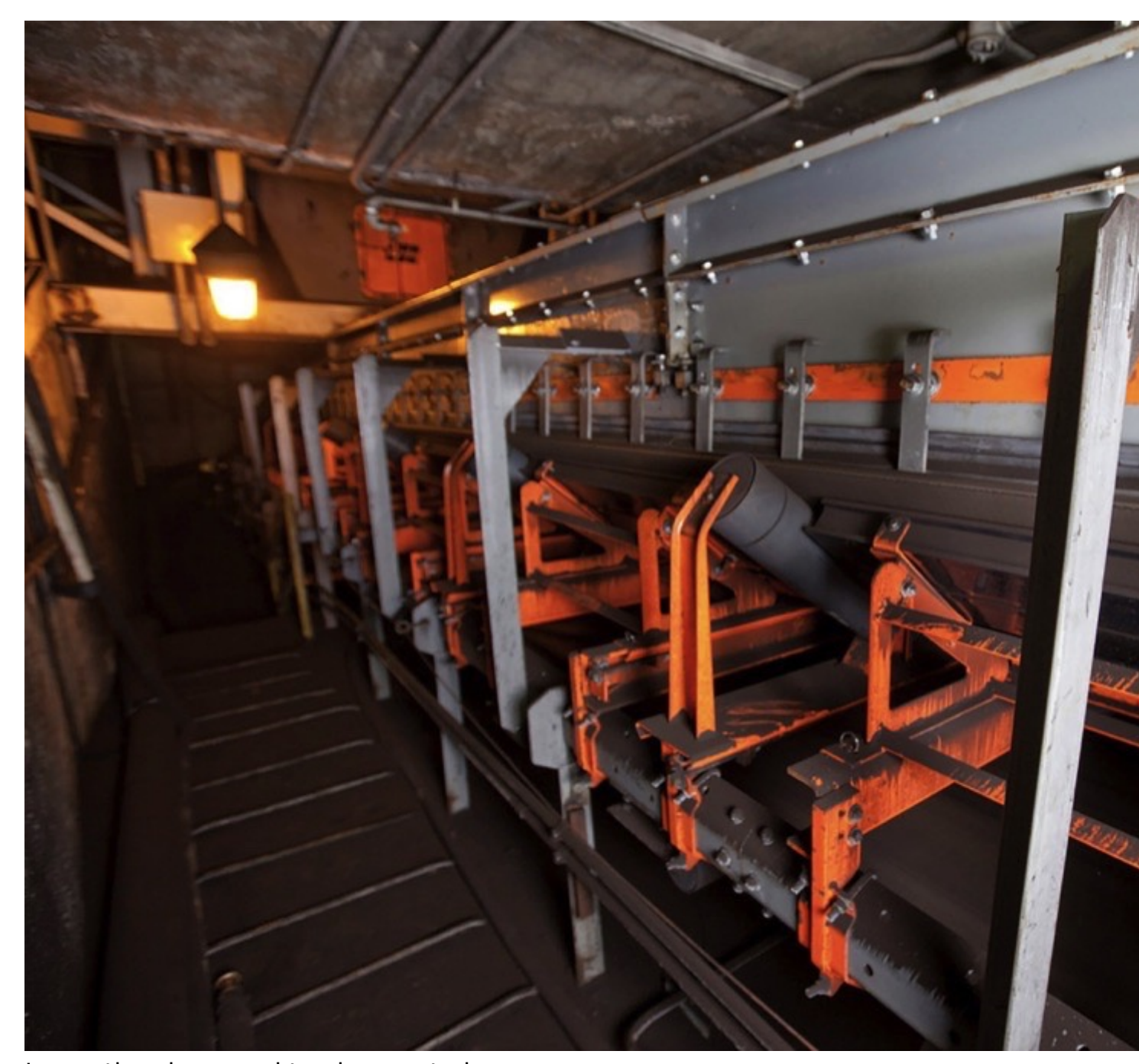
Inspection doors and track-mounted components facilitate maintenance for extended equipment life.

"Many conveyor transfer points still have an antiquated roller system tasked with absorbing impact and centering the cargo," Marshall continued. "These components often break and seize, causing friction and a potential fire hazard. To replace them, several workers must remove the skirtboard and break the plane of the conveyor to reach across the stringer with heavy tools to assess and repair equipment."