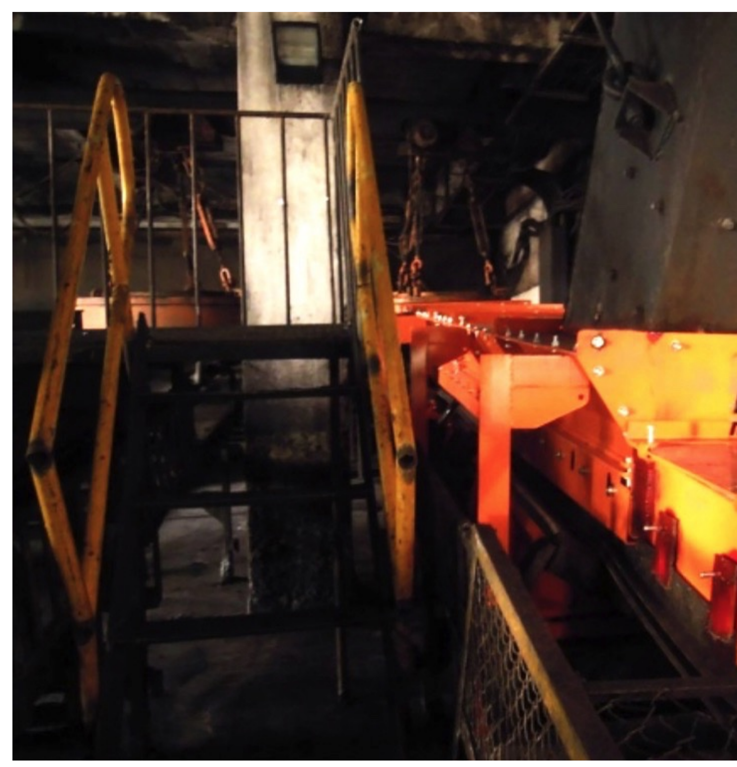
A hatch over the tail pulley allows staff to easily detect entrapped material.

Technicians from Martin Engineering China were invited to perform an on-site assessment and suggest an affordable solution. After offering a detailed proposal, the team installed modern equipment that addressed the issues on both conveyors. The first chute was equipped with a track-mounted impact cradle to improve loading and protect the belt and tail pulley. In addition, slider cradles for smoother centering were installed, along with a full-length apron seal to prevent