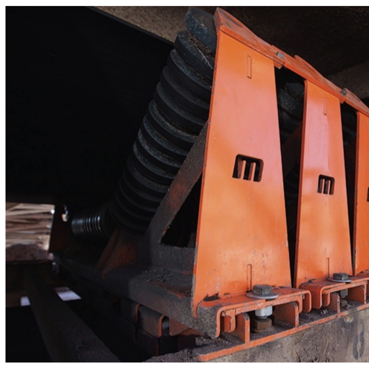
Track-mounted idlers allow easy access for quickly swapping out seized rollers.

Along the cargo path in the settling zone and beyond, retractable idlers support the belt and maintain the trough angle. Exposed to the punishing environment, gritty dust and extreme weather, rollers can seize over time. Often set closely together in the loading zone to avoid belt sag, slide-out/slide-in roller frames permit workers to perform idler service outside of the belt plane without the need to raise the belt or remove adjacent idlers.