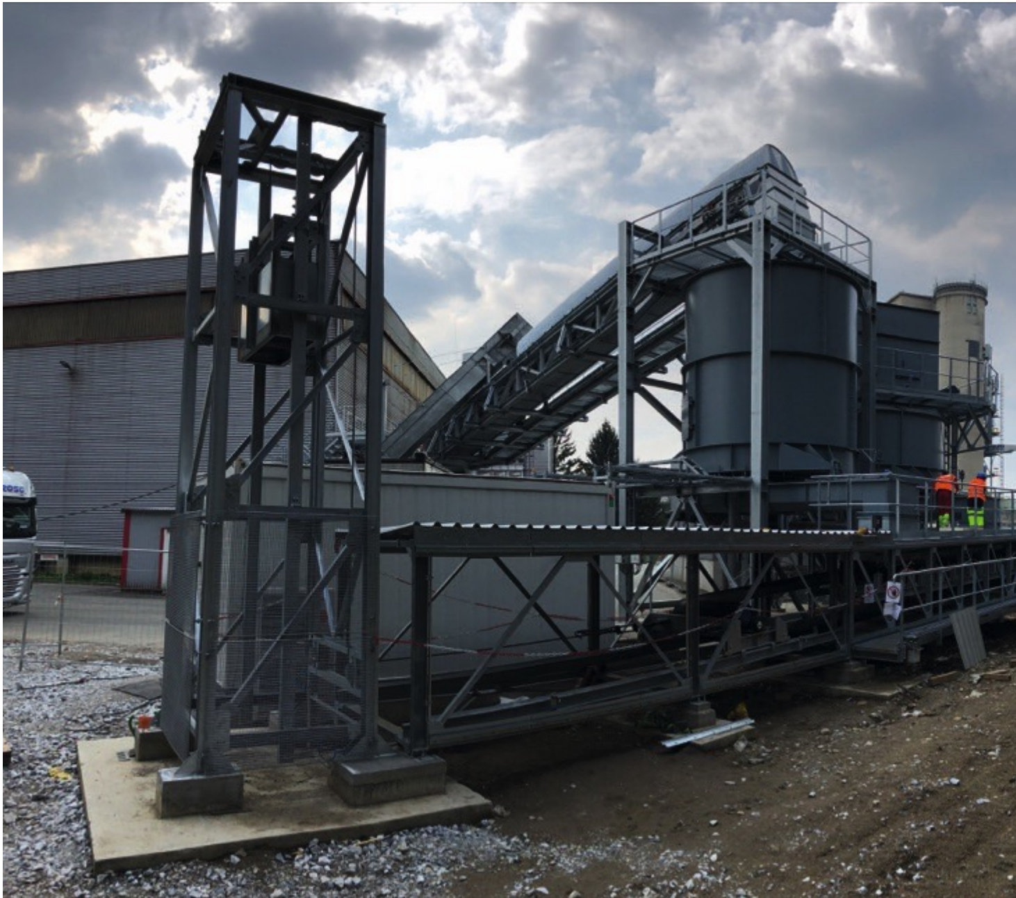
The high-precision system is used in the energy-intensive production of cement.

different bulk densities and can have an extremely high moisture content. These inhomogeneous bulk materials require considerable know-how in their handling. To be able to feed this material mixture, BEUMER Group in cooperation with its customers developed a screw weigh feeder, which can be equipped with an automatic calibration system. The highly precise system is suitable for the continuous, controlled and reliable transport of various bulk materials. Even explosives can be safely conveyed as all components are available also in ATEX version.