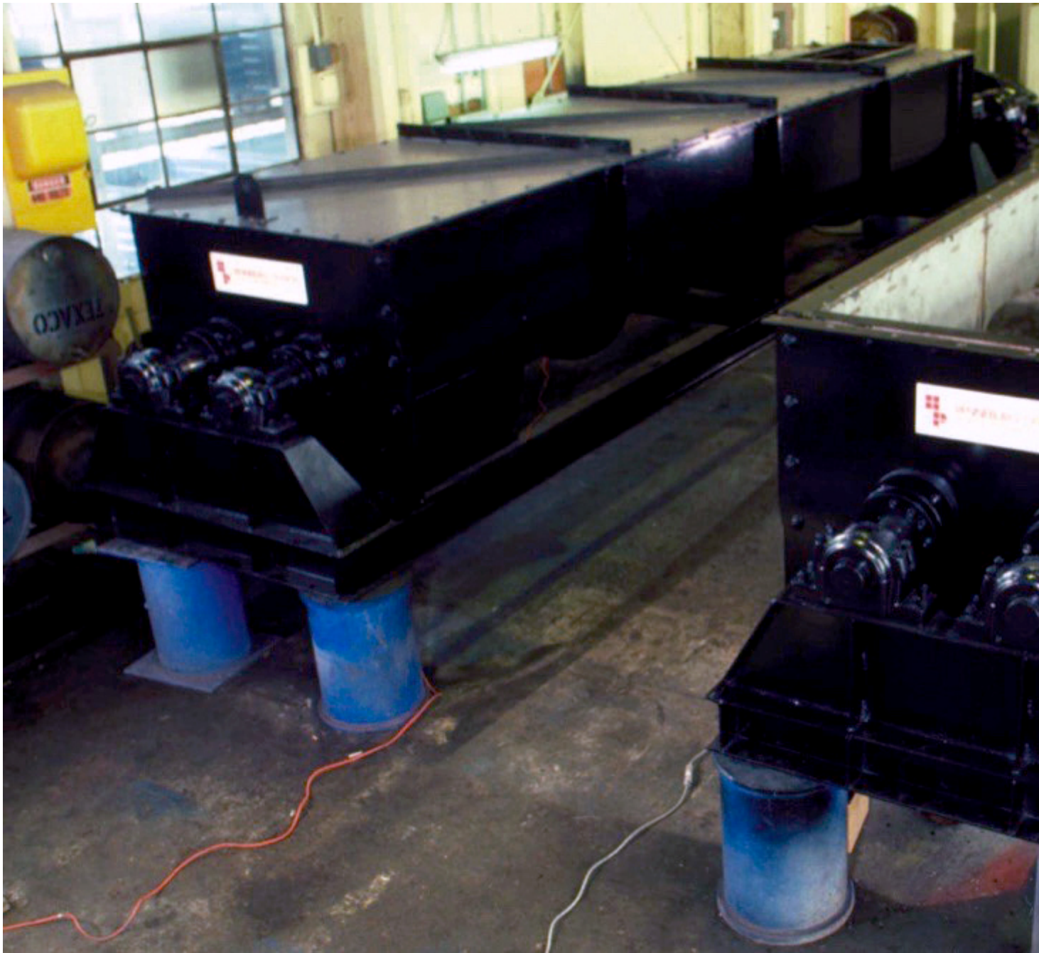
Pugmill mixers in production at Heyl Patterson

pug mill mixer that exactly fits an entire list of criteria may be impossible, because even if a custom solution is an option, then the cost could end up breaking the budget.