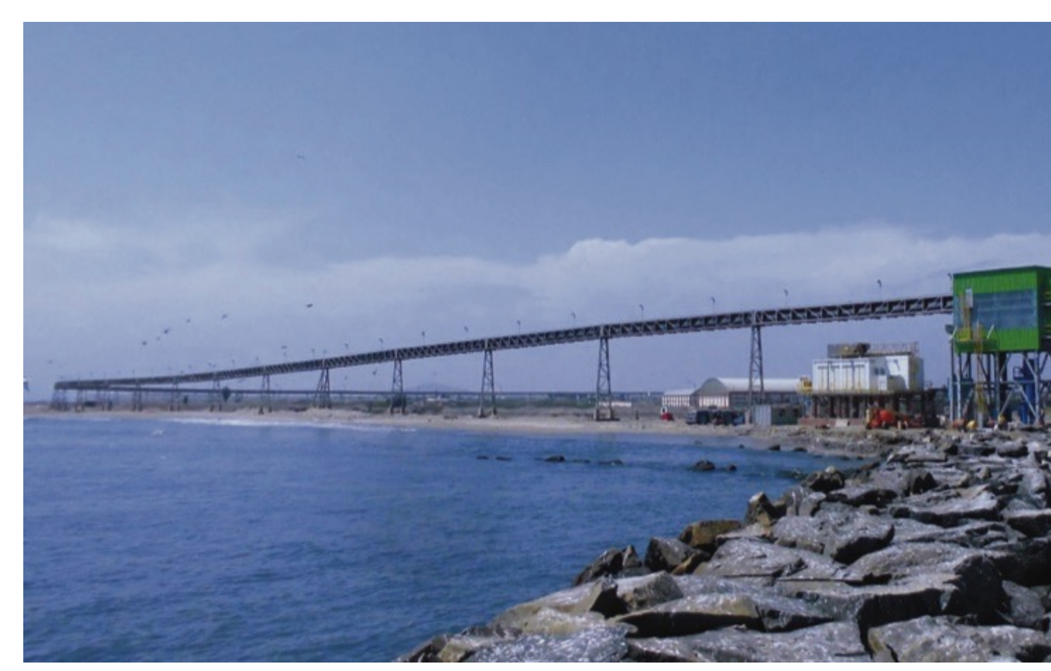
The pipe conveyor ends at the transfer tower, where the material is transferred to the ship loading system.

equipped with fire-proof covers. Due to this impressive engineering work, Transportadora Callao is now able to handle ships for bulk products of up to 60 000 DWT without obstructing the work in the other terminals of the Callao port.