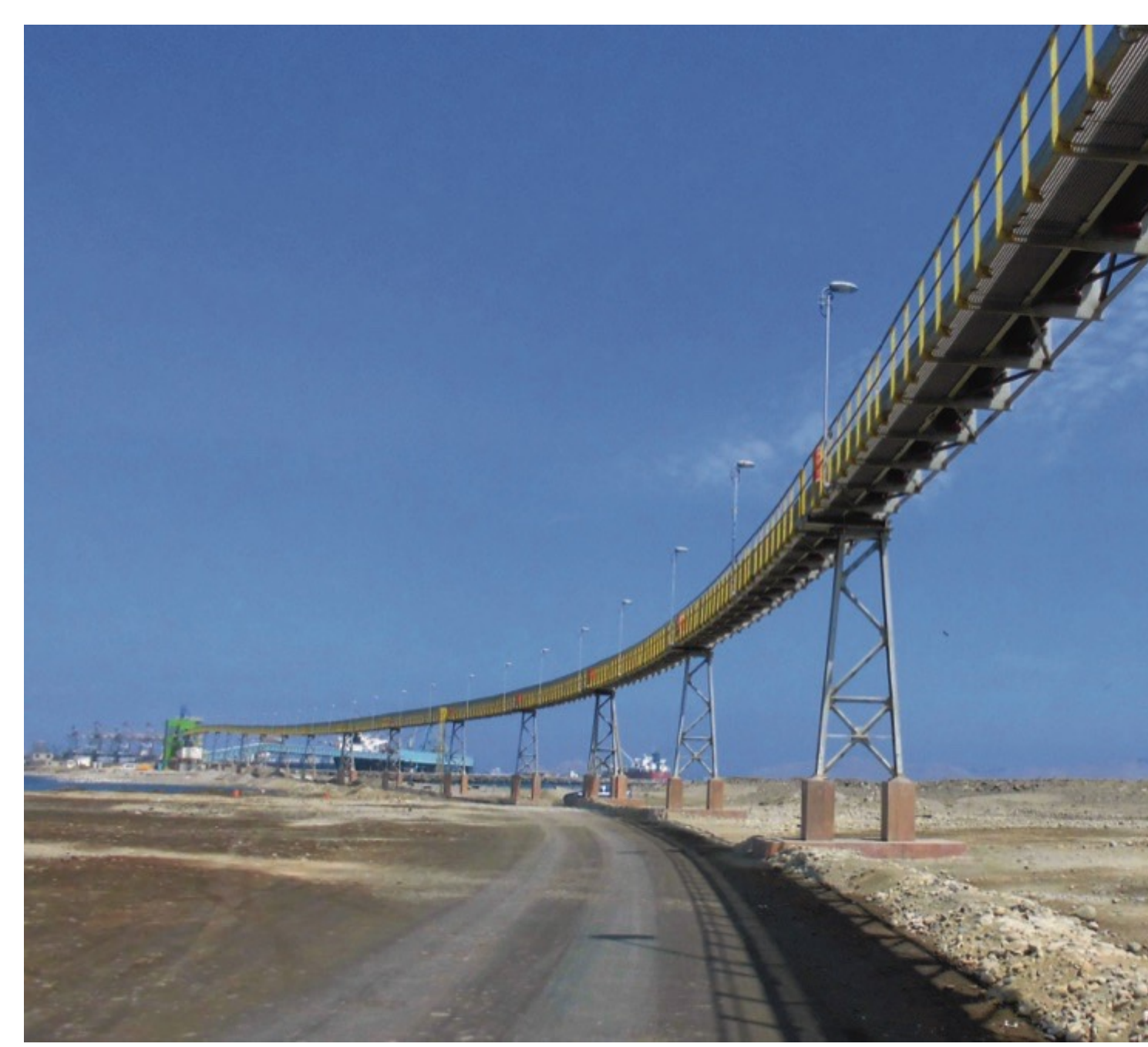
Beumer Group supplied and installed a pipe conveyor with a centre distance of 3195 m.

Transportadora Callao S.A., the logistics operator of a special cargo terminal in the port of Callao/Peru, relies on a Beumer Group pipe conveyor for the transportation of zinc, copper and lead concentrates from different mining companies from the warehouse to the terminal. With its ability to navigate curves in three dimensions, the conveyor can be optimally adapted to its transport route of approx. 3000 m. What is even more important: the conveying system prevents the concentrates from getting in contact with the environment and ensures dust-free transport to the ship's holds. Beumer Group was responsible for engineering and supply of the complete conveying system, including the steel structure, as