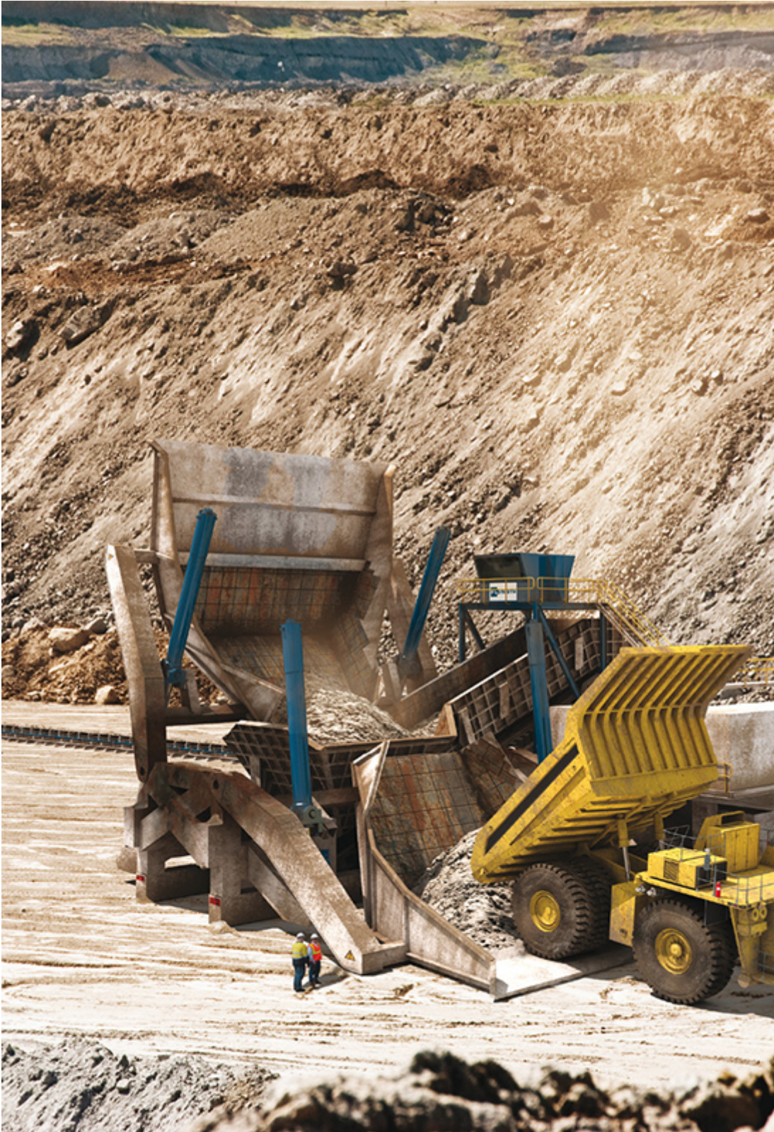
How the DTMS fits into reality

then presents the results overlaid on a single plot window for easy comparison and evaluation. Other tools developed include tools for sizing the hydraulics and components, designing the motion profile, investigating the dynamic loading on the bearings, and estimating the material flow load.