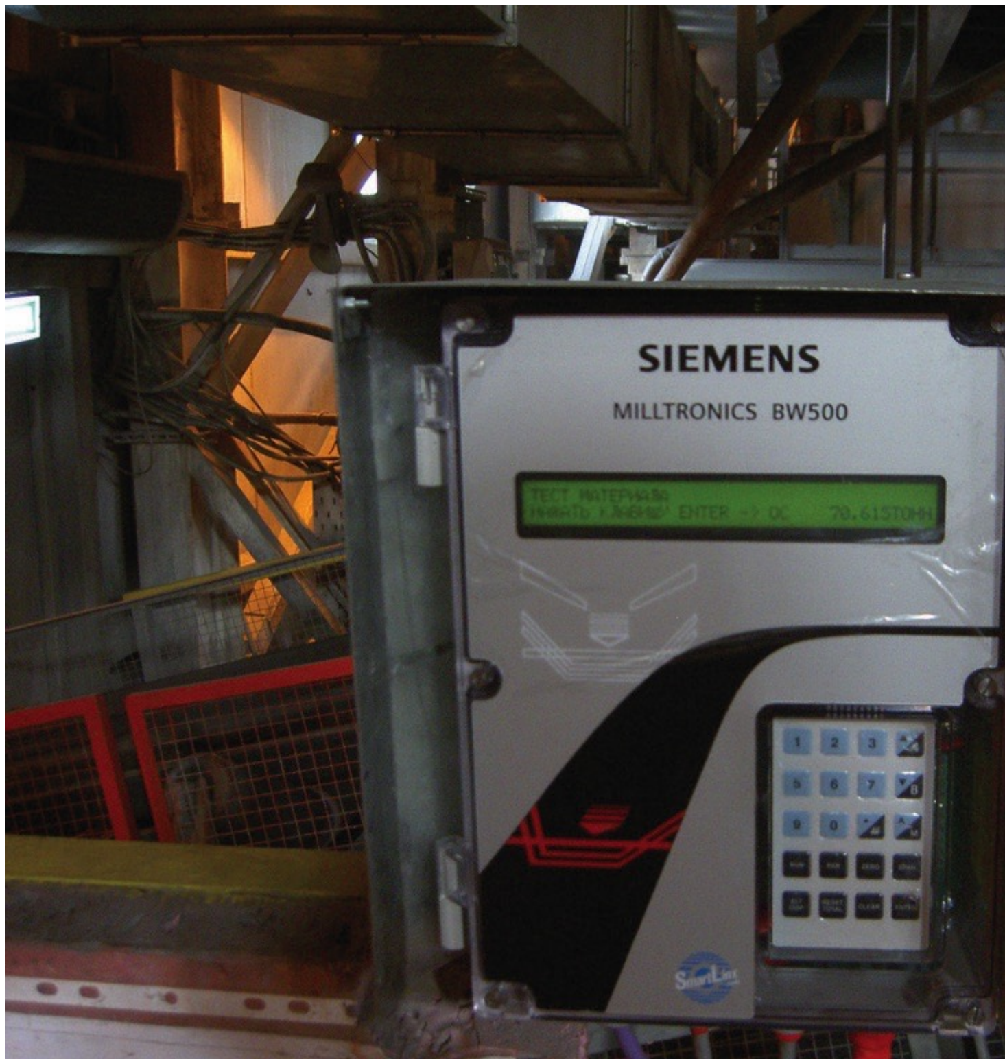
Heart of the system: BW500/L integrator

The company decided on Siemens belt weighing technology, which includes a MSI belt scale, BW500/L integrator, and SITRANS WS300 speed sensor. Operators installed the belt scale with the assistance of Siemens India weighing experts, who provided advice for the correct location of the scale, ways to avoid trapped material or buildup, and appropriate selection of a product to fit the demanding conditions. The scale was installed on a trial for one month and tested in