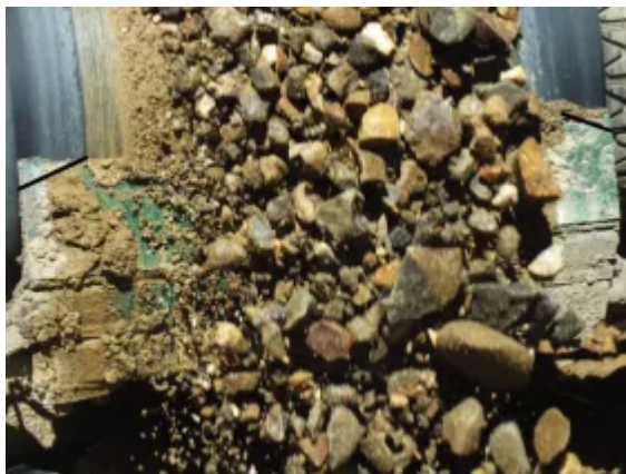
Fig. 1: Typical primary belt cleaner installation. In this picture you also find trim marks for the blade (see below).

In today's mining industry optimized productivity is of paramount importance also in the field of material conveying. This requires belts with clean and undamaged surface. Following please find five points to ponder with regard to belt cleaners.