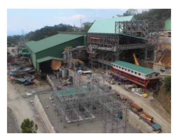
Overview of the Carmen processing plant.

In 2012, Carmen Copper engaged Outotec as its principal technology partner for the upgrade and modernisation of its processing plant. Upon completion of the first phase of the upgrade project, daily throughput is expected to increase from 40 000 tonnes per day to 60 000 tonnes per day.