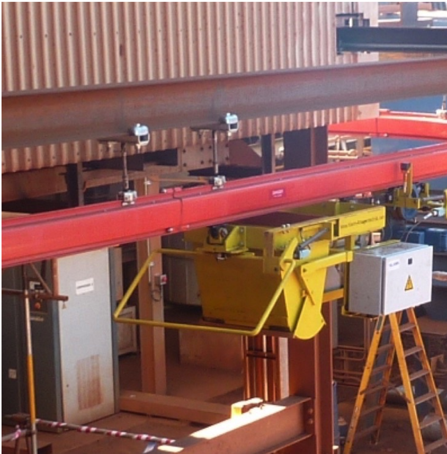
Sample transport system in Port Hedland.

mixers to the raised feed chutes of core shooting machines in batches of 10 – 50 kg.