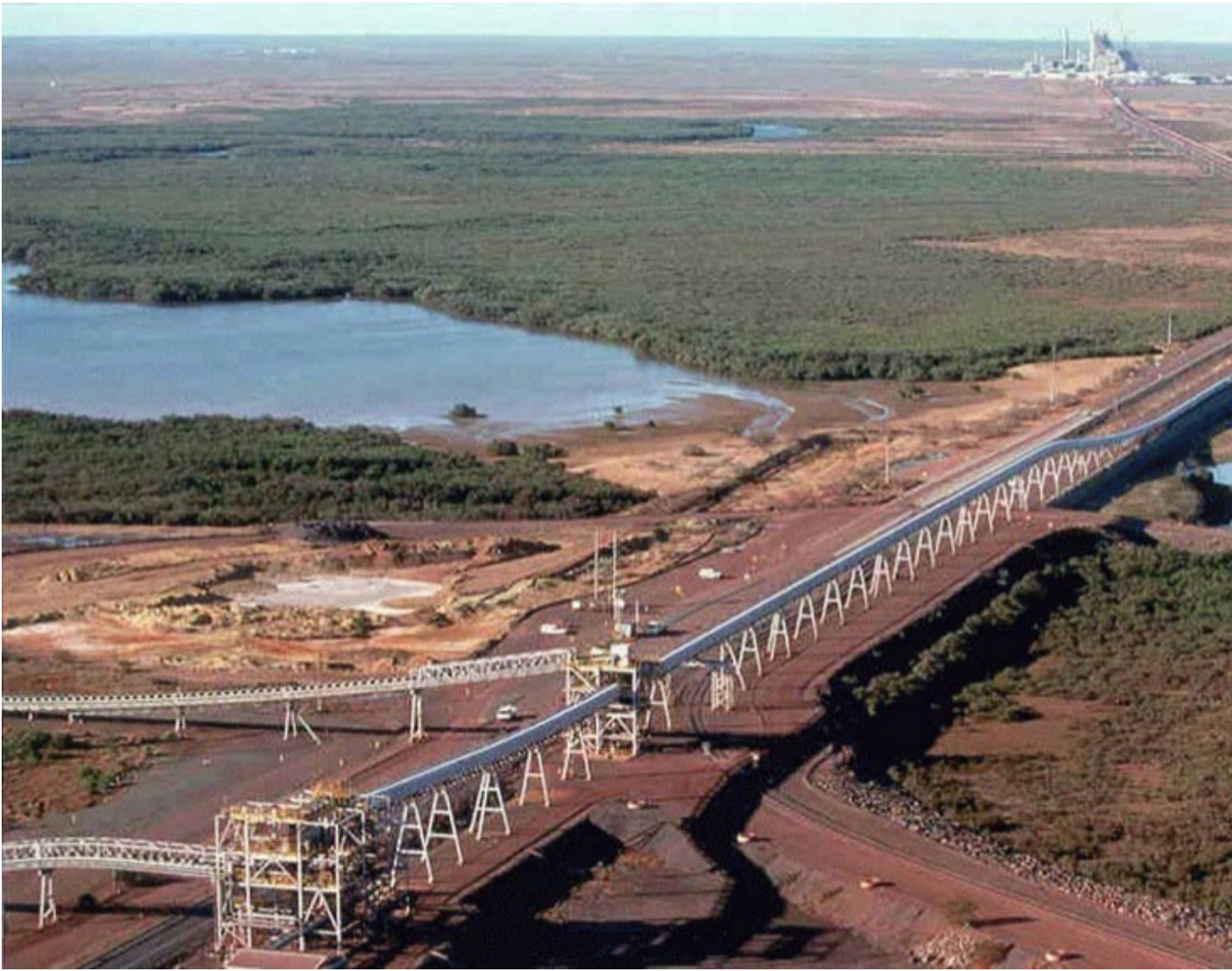
Fig. 1: Conventional troughing overland conveyor, Boodarie, Western Australia.

Belt: Conventional large-capacity, long-distance overland conveyors use a steel cord belt with a single layer of parallel steel cords to carry the belt tension. Vulcanized splices are used to connect belt segments, and are the limiting factors in a belt's carrying capacity. Current findings have led to the acceptance that splice safety factors can be reduced from previous empirical numbers, which had a significant impact on carrying capacity. Idlers: The number of idlers installed directly affects the cost of the conveyor, and idler spacing has increased significantly for overland conveyors. The selection of the idler bearing, seal, and lubricant also has a significant effect on conveyor life, noise emission, and energy consumption. Tensioning System: There are numerous options for tensioning the belt on a conventional overland conveyor, which allow the system to be very flexible and cater to numerous applications and loading conditions. Current knowledge of dynamic conveyor behaviour and take-up control has allowed