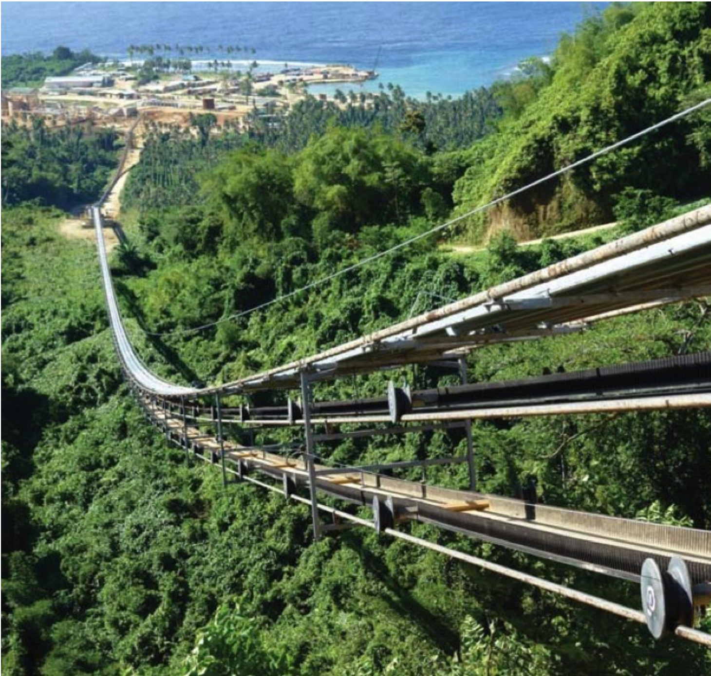
Fig. 3: Ropecon system, Simberi Island, Papua New Guinea.

The hauling and support functions are performed by a belt driven by a drive pulley at the head or tail station. After material discharge, the belt is turned over along the return length to eliminate any dispersion of residual material and dust and then turned back again before it reaches the return station. The wheel sets are integrated into the belt and are supported by cross-members or axles mounted. The crossmembers act as cleats, allowing the conveyor to work at angles steeper than those achievable by conventional and cable-hauled