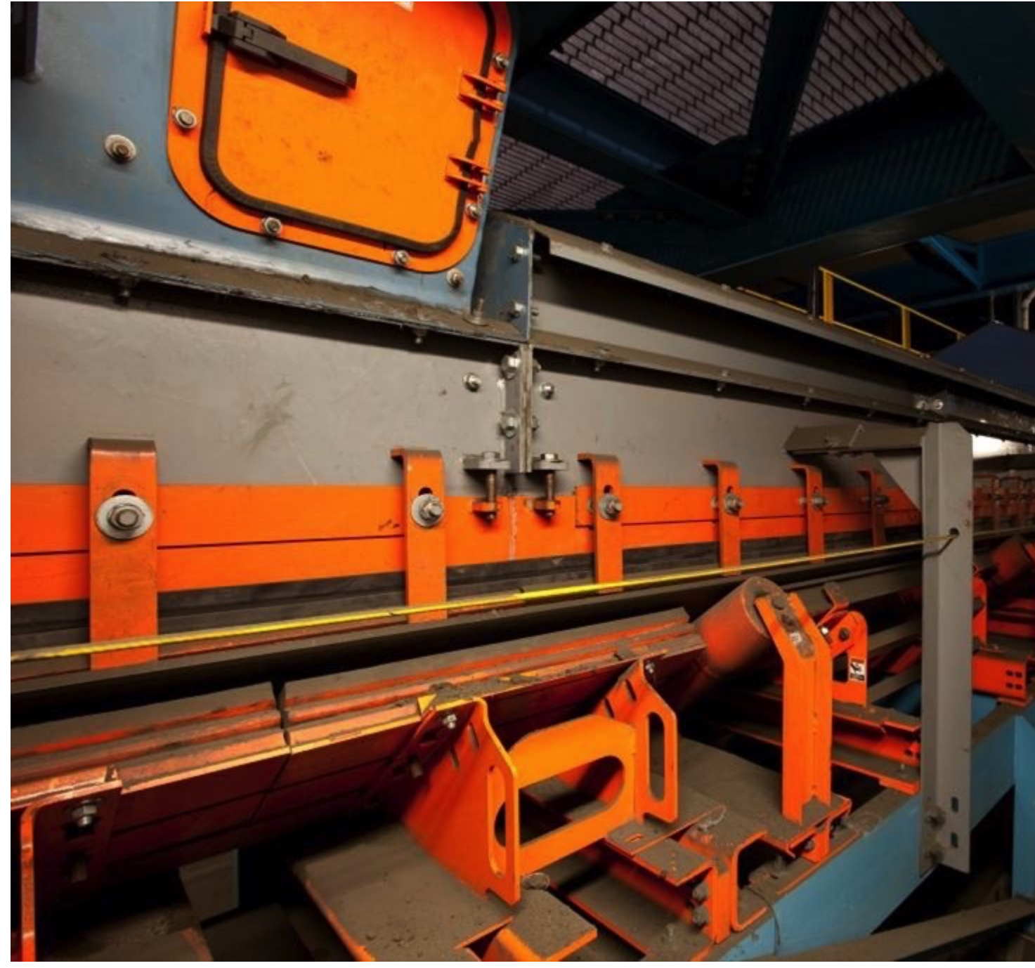
Fig. 3: Martin® ApronSeal Skirting is a dual-sealing system, with a primary seal clamped to the steel skirtboard and an "outrigger" strip to capture