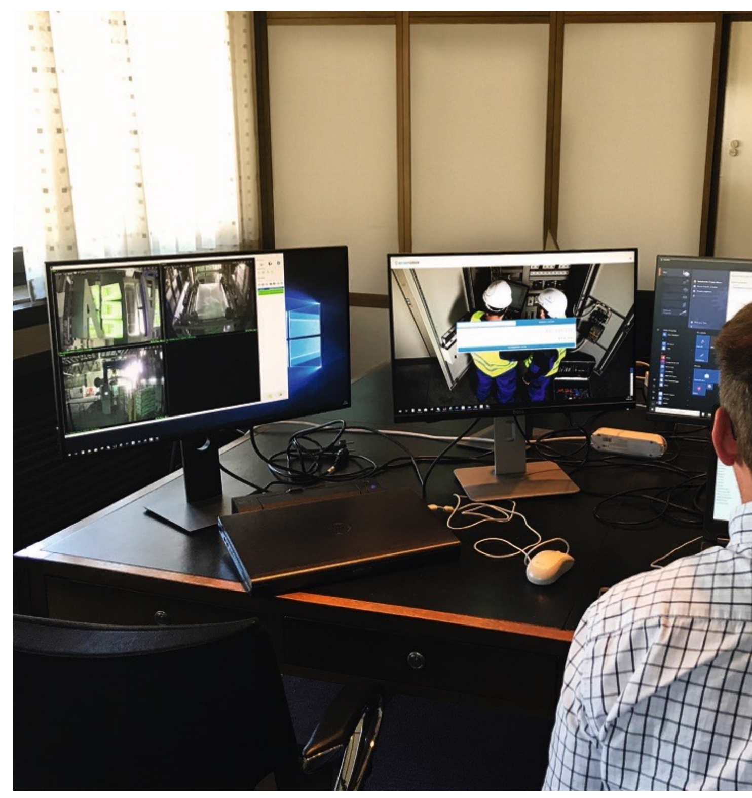
The user is guided through the commissioning process from the back office.

BEUMER Group set up a separate back office for this project at short notice: Using four monitors and a laptop, the service staff always had an overview of the images from the IP cameras, the field of view of the BEUMER Smart Glasses and the data of the system sent via the VPN client.