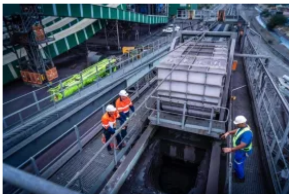
Inspection of a transfer chute at a coal mine.

The company also has a reliability model which tracks the duty and condition of each chute over time, and which can inform a predictive maintenance programme. Through its decades of experience, the company has developed a detailed understanding of chutes' wear trends under varying material conditions.