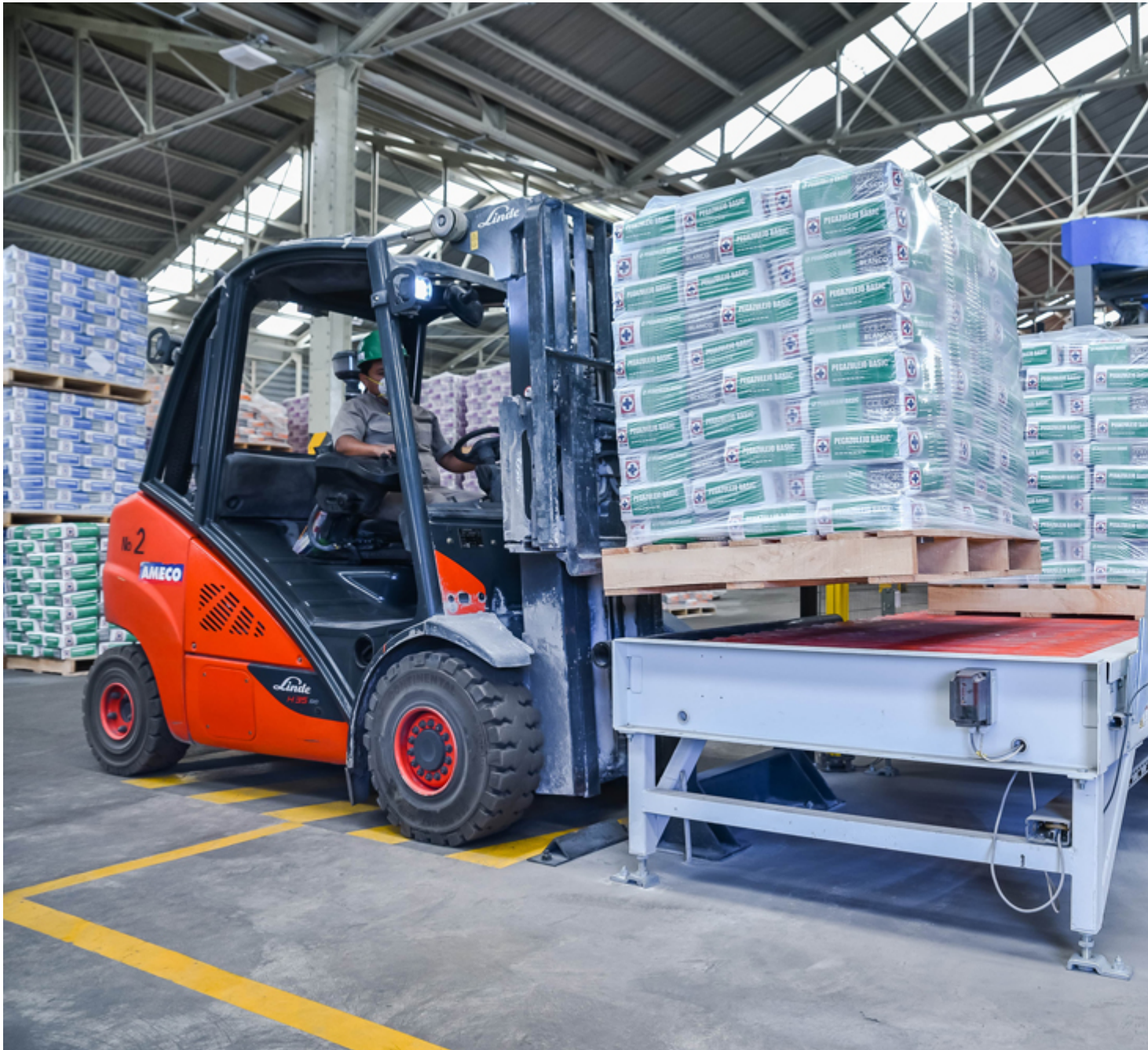
Picture 10: Picking up the palletised and packaged products with a fork-lift truck and delivering them to the outgoing goods.

In June 2016, Cruz Azul put the line into operation. "The new BEUMER packing line brought the project to success," mentions Victor Luna . Which means that the cement manufacturer can reach its projected production capacity. In order to ensure a trouble-free operation, the system supplier's competent specialists stay in close touch with the customer and help out immediately in case of malfunctions or downtimes. BEUMER Group also provided the necessary spare parts. Ensuring high availability of the systems at all times.