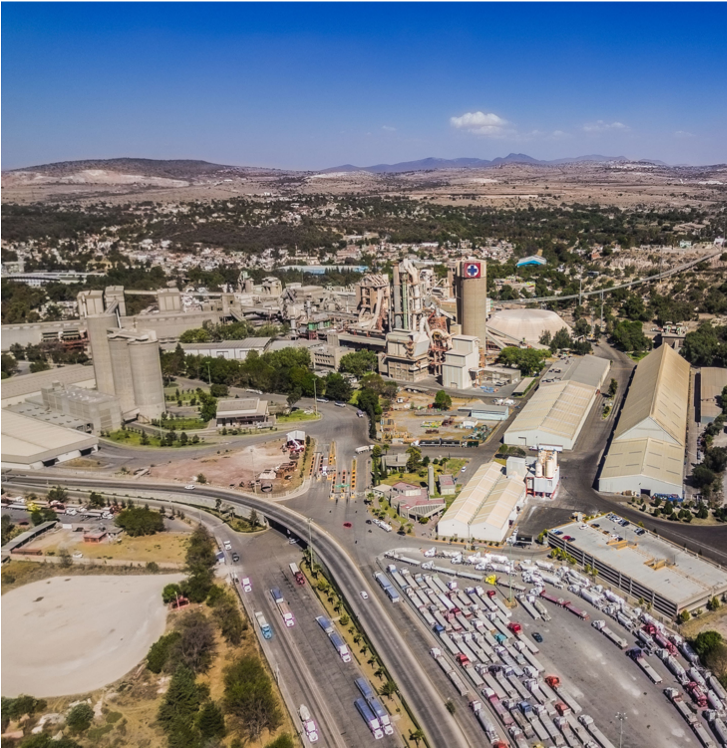
Picture 1: One of the sites of the Cooperative La Cruz Azul is in Hidalgo. Some of the newest products of the cement manufacturer are eight different types of a new tile mortar.

Gigantic bridges, high-rises, tunnels for roads, subways and sewage systems: some of biggest construction projects in Latin America are currently being built in Mexico. This makes the country the second largest cement market on the