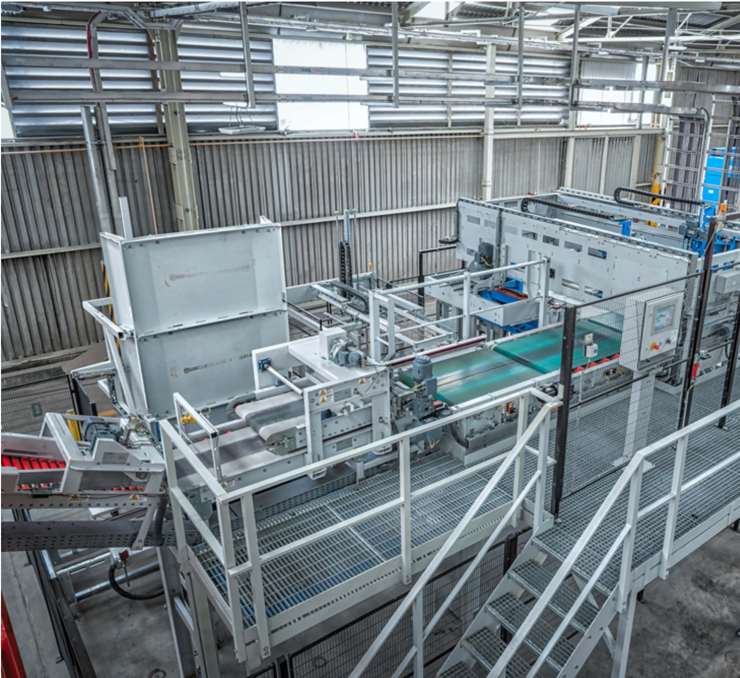
Picture 6: The packaging line operates around the clock. Which means that the cement manufacturer can reach its projected production capacity.

For the subsequent fully automatic, reliable and most of all fast palletising, BEUMER Group installed a BEUMER paletpac layer palletiser . Per hour, it gently and reliably stacks 2,200 bags per hour in 10-bag patterns or in 8-bag patterns on pallets of 1,220 x 1,020 x 245 millimetres in size. "A twin-belt turning device brings the bags in the required, dimensionally stable position," explains Buchholz . The position accuracy of this device offers a great advantage compared to conventional turning machines, because the system's components