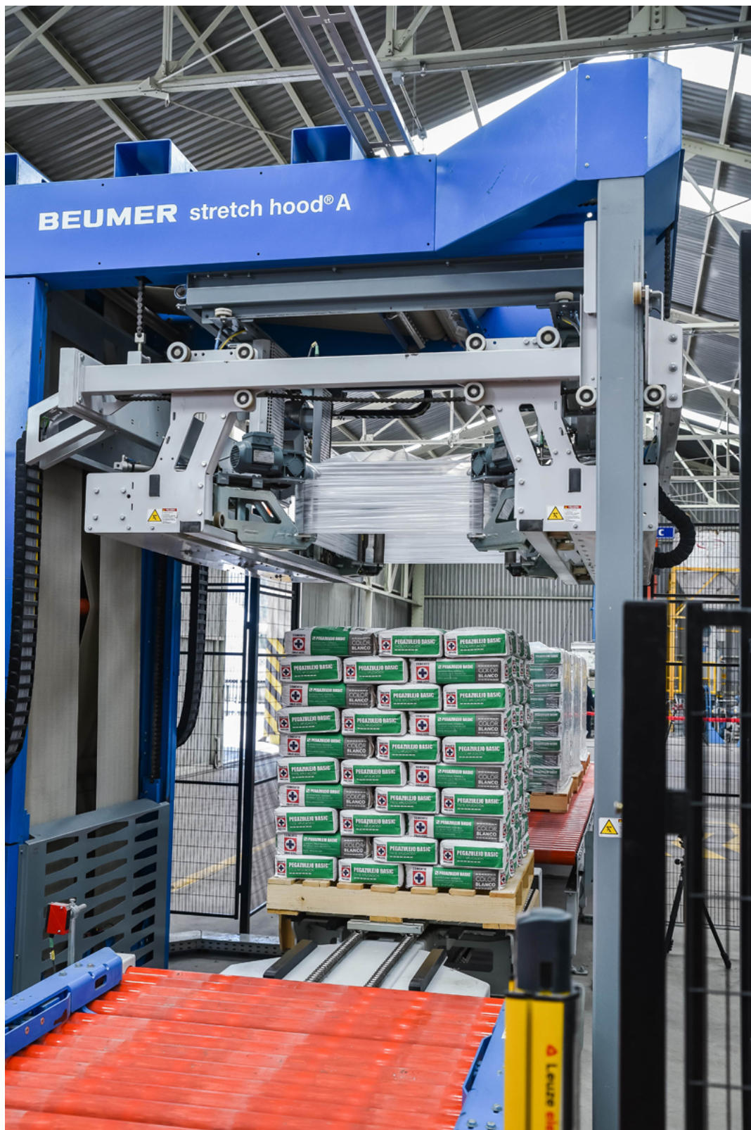
Picture 9: The BEUMER stretch hood A packages the bag stacks with a stretch film hood. This protects the product against damage during transportation and atmospheric influences.