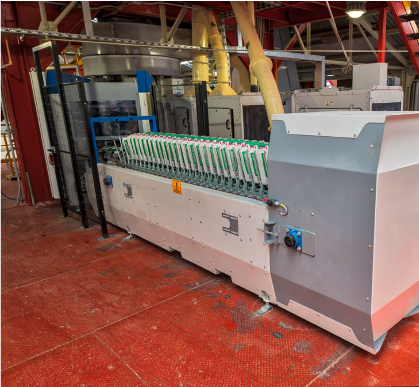
Picture 4: The BEUMER fillpac R is equipped with a ream magazine for 700 bags