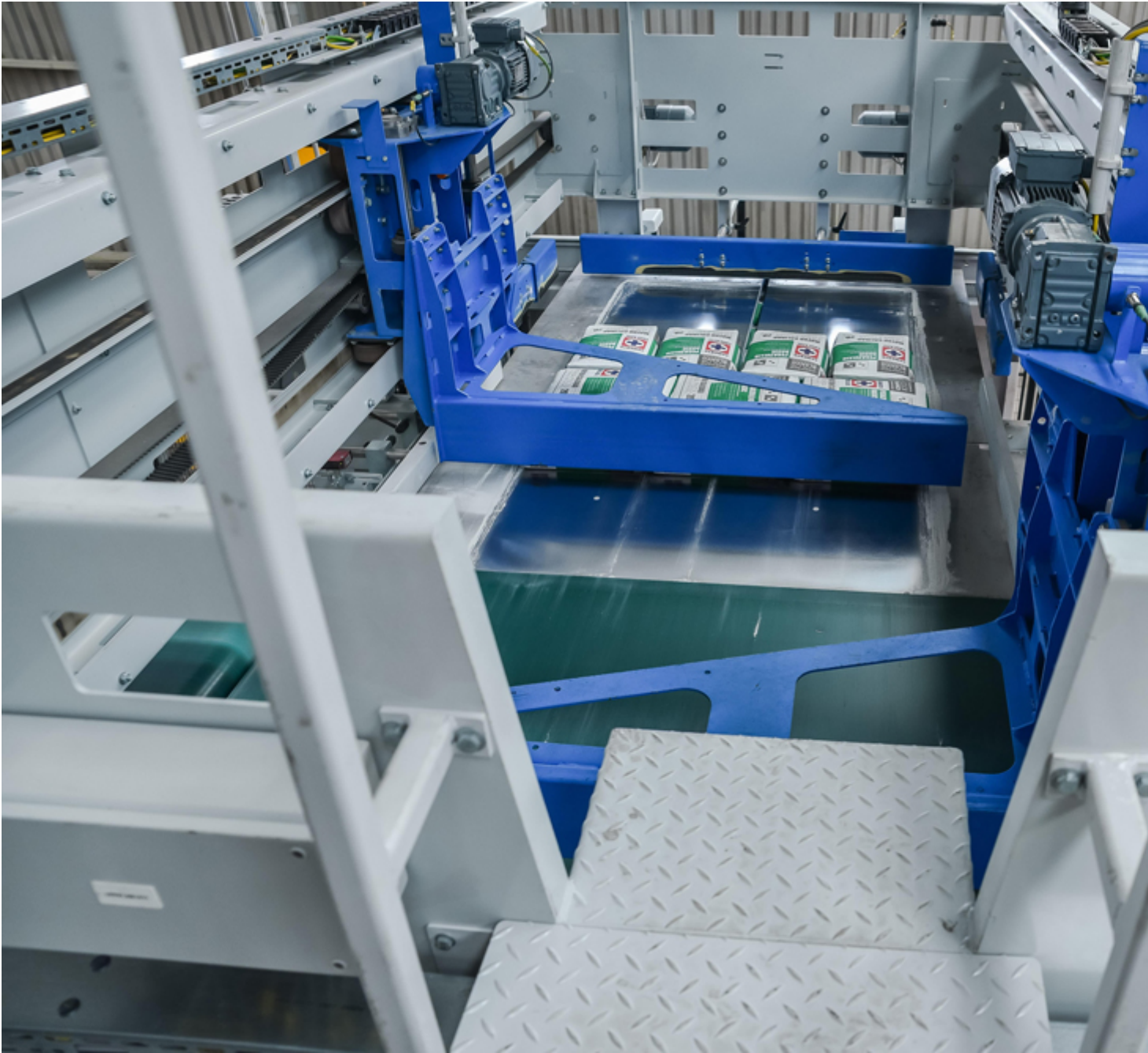
Picture 8: The BEUMER paletpac layer palletiser can stack the bags in a 8- or 10-bag pattern onto pallets of 1,220 x

stacks per hour with stretch film hoods with film thickness ranging from 40 to 100 micrometers. "It depends on the type of tile mortar," Buchholz explains. "The packaging protects the product against dust and humidity during storage and on long transport routes and ensures that the bags remain stable on the pallet without moving." In order to facilitate the work for the maintenance personnel and to ensure high system availability, the packaging system no longer needs a platform. Maintenance work, such as changing the blades or the sealing bars, is handled at floor level. Additional benefits include the compact design and the resulting low height and small footprint.