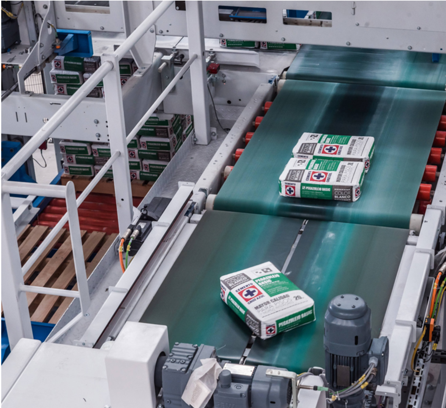
Picture 7: The twin-belt turning device accurately positions the bags quickly and gently.

move the bags without mechanically deforming them: two parallel driven belt conveyors move at different speeds and turn the bags quickly into the desired position. The intelligent control of the twin-belt turning device also takes the dimension and weight of the filled bag into consideration. Exact positioning, specified by the preset packing pattern, is achieved. "No adjustment is necessary even with a product change," says Buchholz .