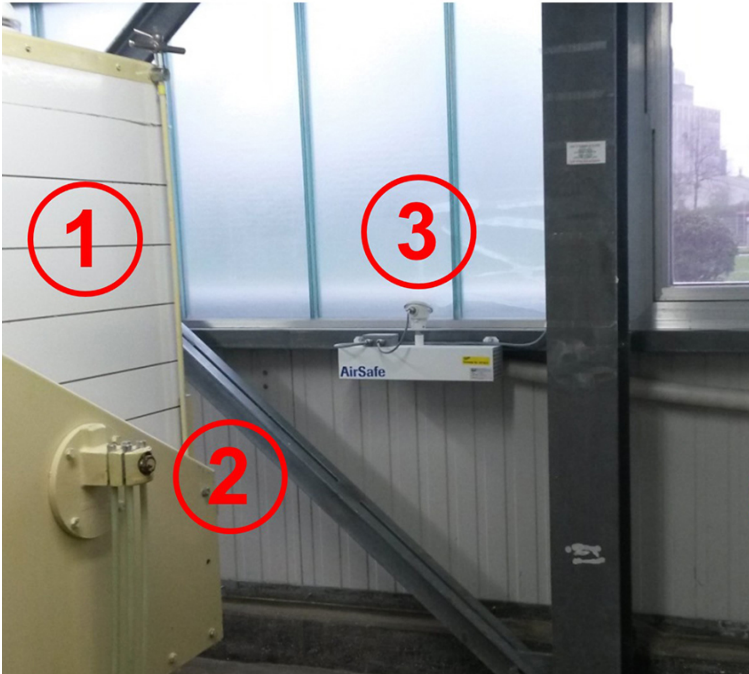
AirSafe - Application

Process data Customer: food manufacturerMaterial: starchInstallation location: screening plantFunction: causes the system to shut down if material clogs up the adjacent fine screen.