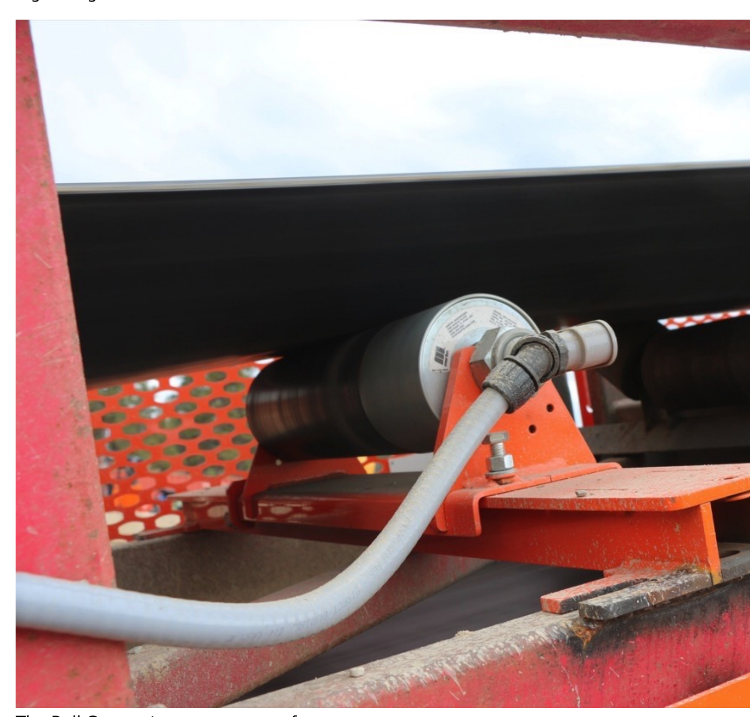
The Roll Gen system uses energy from the moving conveyor belt to generate power for lighting at night.

pm. With this system in place, it runs all day off the conveyor belt, storing energy in a battery bank. Then we use that stored power to run our security lights all night long.