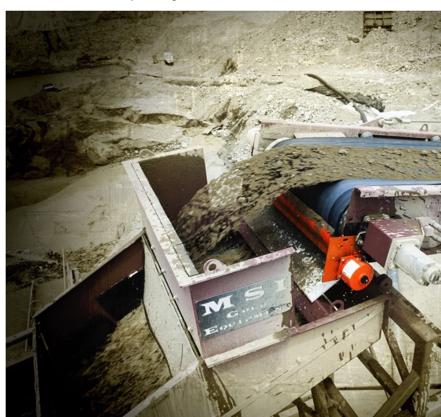
The heavy-duty primary belt cleaner can be replaced safely by one person

I've seen in my 20 years of mining. But it's been in service for six months without us having to touch it. And the cleaning performance is great."For the wet conveyor, the Martin technicians selected a heavy-duty primary belt cleaner that features unique technology to maintain the most efficient cleaning angle throughout its service life. Equally important given the time constraints of the competition, the blade features a no-tool replacement process that can be performed safely by one person in less than five minutes. For the secondary cleaner, a rugged design with individually-cushioned tungsten carbide blades was installed to withstand the punishing conditions.