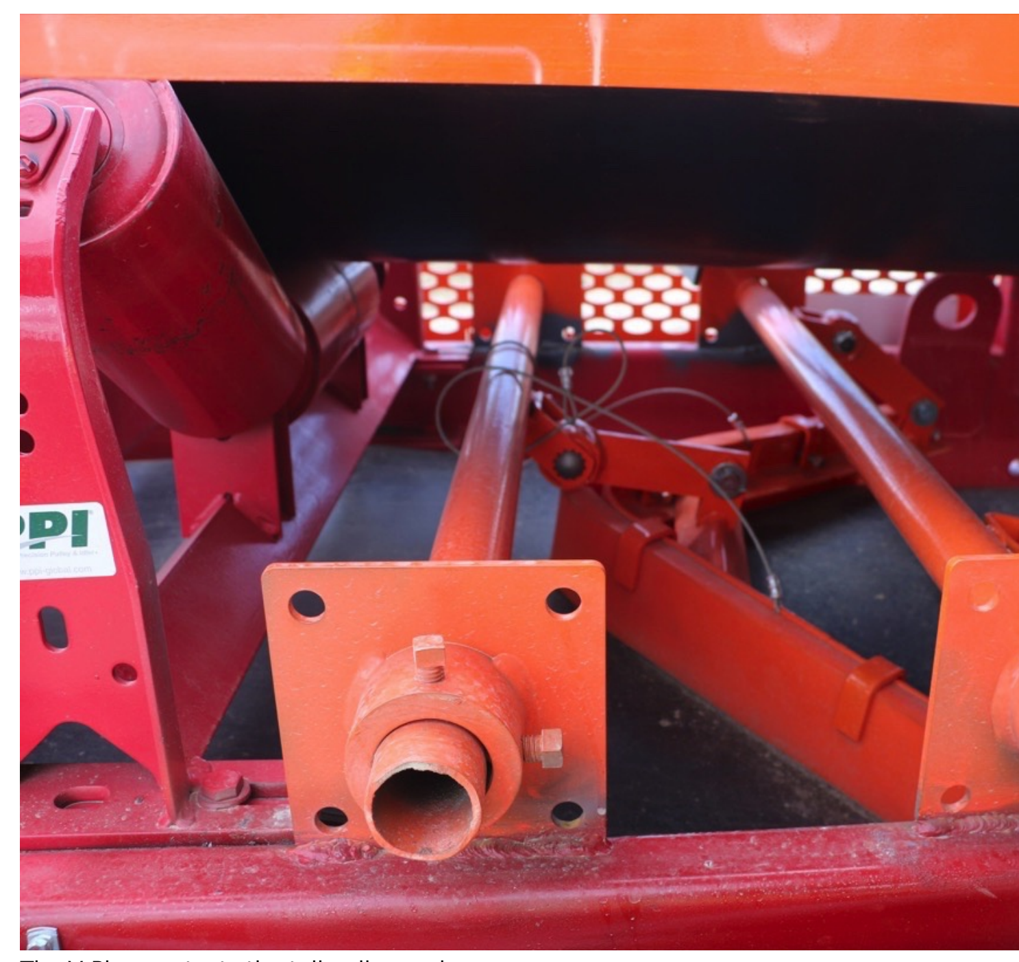
The V-Plow protects the tail pulley and belt from fugitive material on the return side.