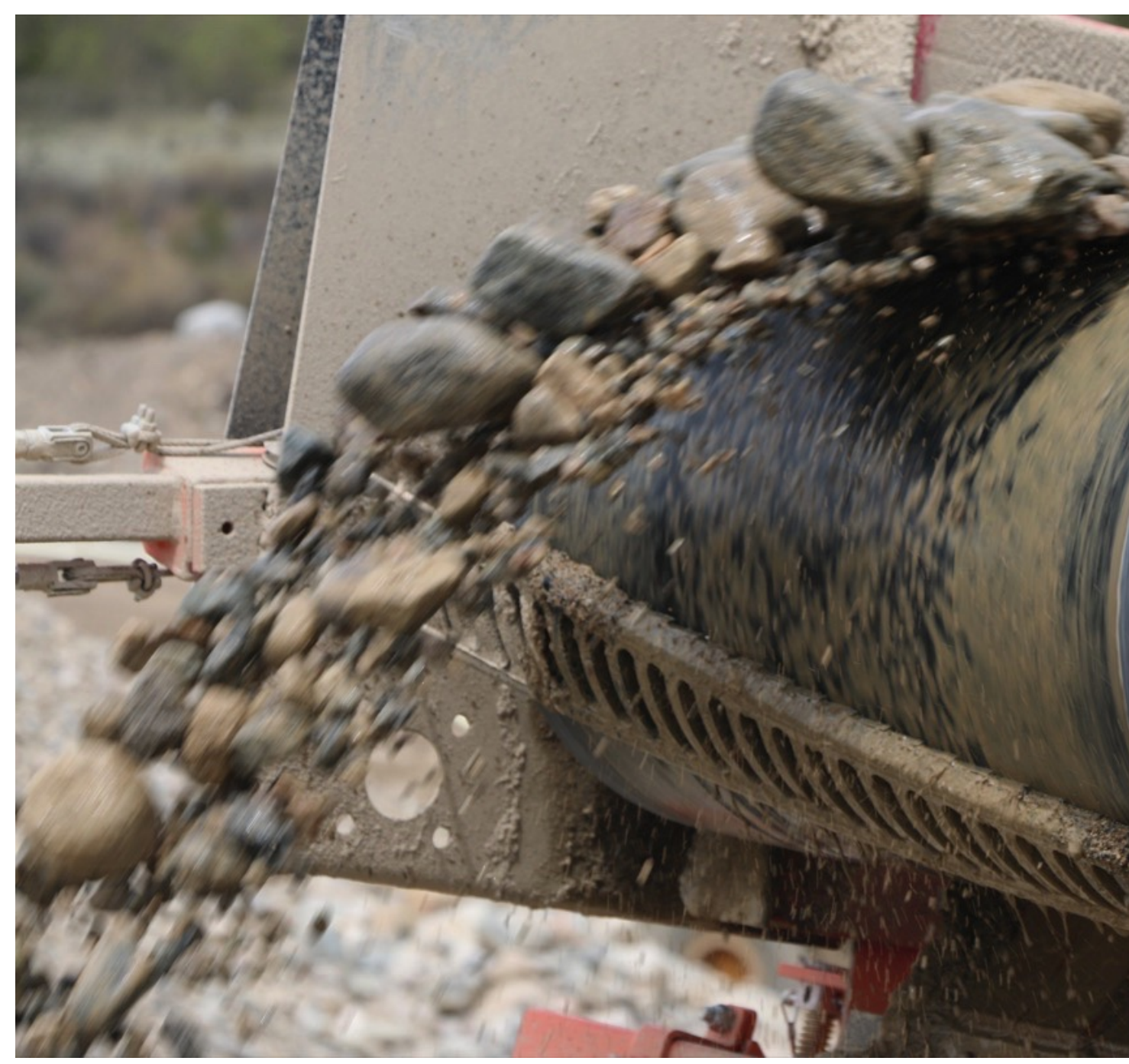
The CleanScrape design provides as much as 4x the lifespan of conventional belt cleaners.

"Belt cleaning was one of our biggest obstacles at the time," he recalled. "We were wasting both material and labor, and we couldn't afford to give that advantage to the competition." Martin Engineering technicians traveled to the Colorado site and reviewed the entire conveyor network, recommending specific cleaner designs for each application. On one they recommended the company's patented CleanScrape® design, which is engineered to provide as much as 4x the lifespan of conventional cleaners in difficult applications. "When I first met with the Martin guys, I had trouble envisioning how it would work. It's unlike anything