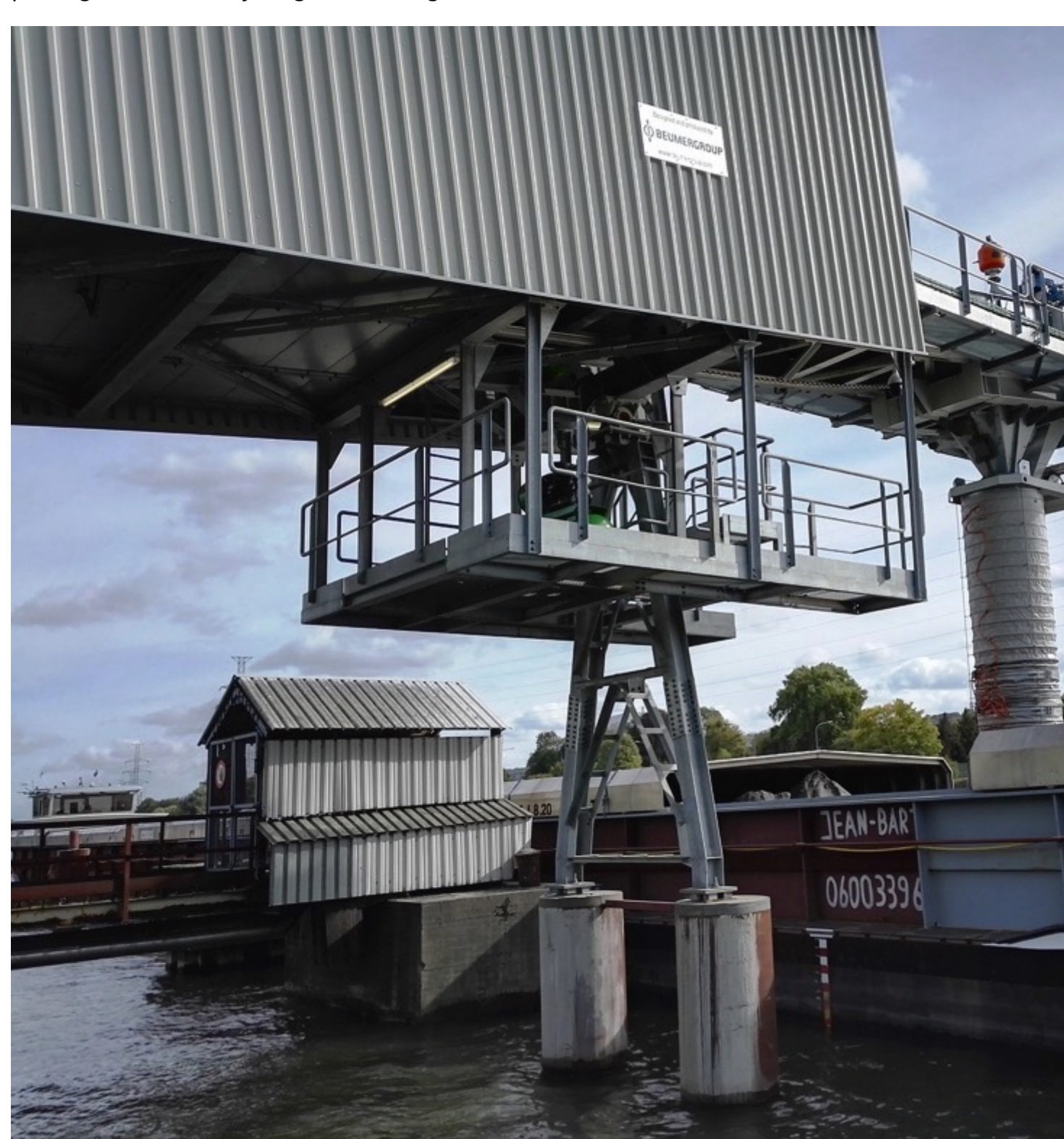
With loading systems from BEUMER Group, the bulk material is safely

tight curve radii enable individual routing adapted to the respective task and topography. BEUMER Group relies on camera-equipped drones for the planning, projection, implementation and documentation of these systems. Using special software solutions, the system supplier evaluates the aerial photographs photogrammetrically to generate digital terrain models.