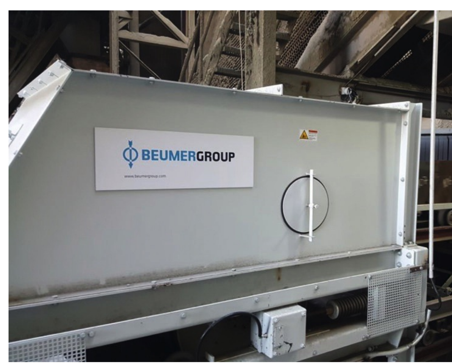
BEUMER Group provides cement manufacturers with belt apron conveyors for the transport of hot clinker.

The product range of the system supplier includes stackers and bridge reclaimers for storage yards, whether with or without blending bed systems. These stack bulk material and guarantee a maximum blending effect. Users can also efficiently homogenise large quantities of different bulk materials and bulk material qualities and thus ensure the uniformity of the raw materials used. For efficient loading, BEUMER Group supplies ship loaders with fixed booms and extendable telescopic belt conveyors, as well as bulk loading heads, which are used to load bulk materials into silo vehicles quickly and without dust.