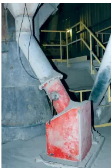
Fig. 4: St. Marys Cement in Canada has been using the Siemens E-300 solids flowmeter for over two decades.

I have been working with flowmeters for eight years and I consider myself to be well versed. I have colleagues who have been working with this technology for 35 years and they consider themselves to be experienced. However, I have yet to meet anyone who considers himself or herself a flowmeter expert!