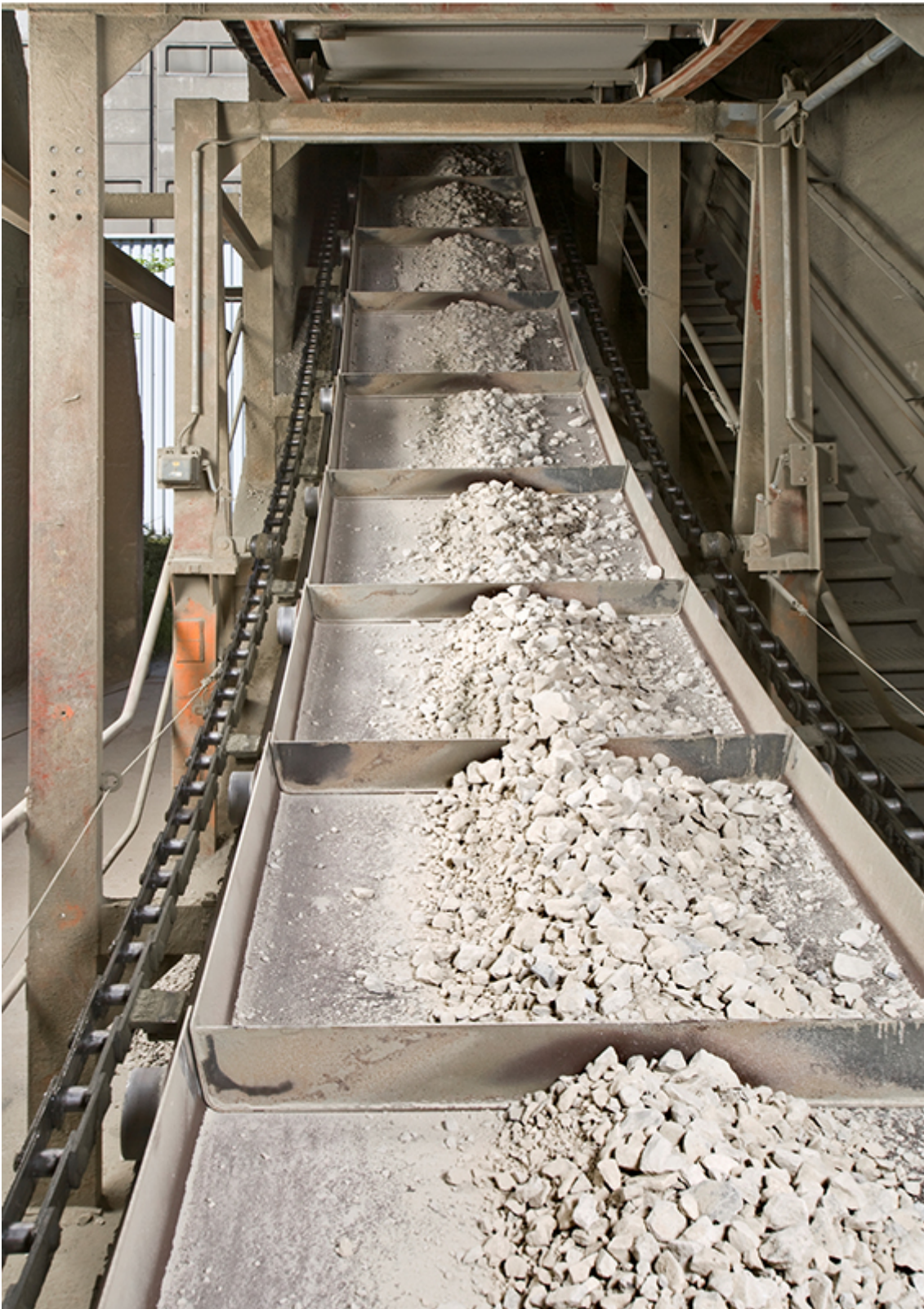
Pivoting Pan Conveyor type SPB

The Aumund type ordered for the Eskişehir plant is an SPB, with a centre distance of 42 m and a capacity of 250 t/h. This particular model is equipped with three discharge stations and permits material feed into silos through stationary discharge stations. The pan construction allows the material to be distributed between several silos and bunkers. As a result any additional equipment, such as conveyors with their supporting structures and transfer chutes, is no longer