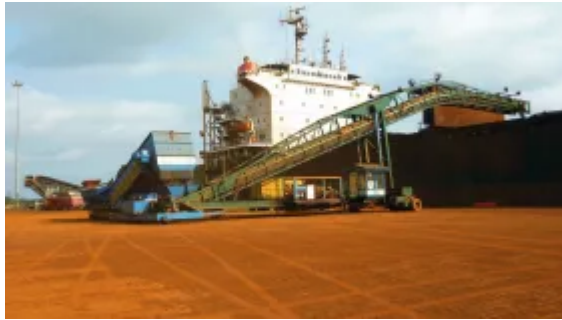
Exporting iron ore from Arcelor Mittal Liberia for steel production.

In Peru the Goldfields Company operate from an existing port jetty and receives material direct from tipping trucks coming from the Cerro Corona Mine situated in the highest part of the Andes in northern Peru. The project involves the production of gold and copper by conventional open pit mining methods, and the copper-gold flotation concentrate is trucked to the Port of Salaverry for shipment to smelters in Japan, Korea and Europe. In this operation the concentrate is transferred direct from truck to ship using an integrated Samson style feeder mounted to the Shiploader chassis as a single and fully integrated one piece machine.