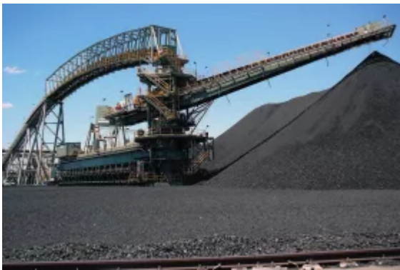
Circular storage and blending bed by Schade for BHP Blackwater mine Australia.

Of course the wagon tippler may be supplied with the associated plate feeder or, where excavation depth may be limited, the Samson feeder offers significant advantages. From the road truck or railcar discharge the raw material or fuel may be conveyed into the storage hall and stacked by travelling stacker or from overhead tripper system all of which are offered by Schade along with the automation package for unattended operation.