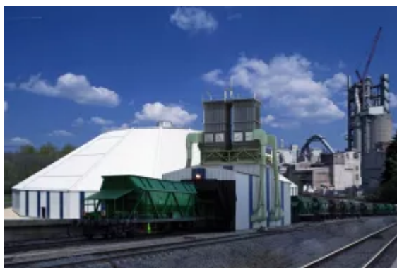
Hopper bottom railcar discharge to circular storage.

The Samson Surface Feeder concept offers the most economical and environmentally friendly solution for raw material or fuel import from tipping trucks. Being surface mounted of course saves on civil works but also reduced the uncontrolled free fall with associated displaced air and as a result dust generation is mitigated at source saving on expensive dust plant and reducing operating costs.