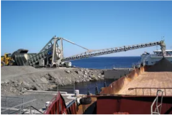
Stormajor loading Gabros rock for aggregate onto a barge in Russia.

direct from road trucks at an existing rail siding without the need for fixed plant or infrastructure. Typically, a recent installation at Poznan, Poland, where Melafyr rock (similar to Basalt) is delivered to the Stormajor® by articulated dump trucks and loaded at a rail siding close to the mine.