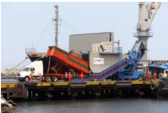
Exporting copper concentrate from Peru direct from truck to ship.

Of course for deep sea shipment the concept is similar but larger equipment is required to load larger vessels: two examples are covered herein showing a project in Peru handling copper and gold concentrate and another project in Liberia handling iron ore.