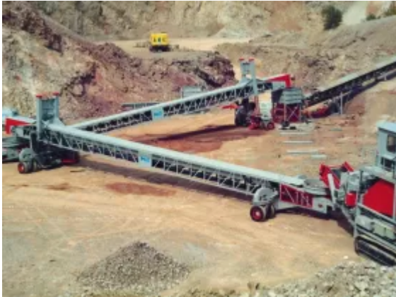
Self propelled mobile link conveyors for a track mounted face crusher.

the head and tail sprocket and an effective seal maintained to reduce risk of spillage between the plates. Available with a total plate thickness of 80 mm and maximum plate width of 3 metres these machines may be matched to the largest haul trucks for handling rates to 3,000 tons per hour.