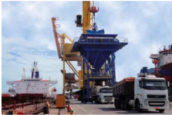
Dust controlled tyre mounted Eco-Hopper ship discharge to tipping truck.

from grab into the receiving hopper air is displaced which collects the free dust particles and the dust laden air is ejected from the hopper at high speed. The same problem applies to the loading of the tipping trucks where again air is displaced and any uncontrolled dust is ejected from the truck body. If uncontrolled combining both the dust generation from the grab discharge and from the truck loading is a double whammy and the result will be billowing clouds of dust from the discharge operation causing considerable pollution and being a hazard to the health of all working in the vicinity.