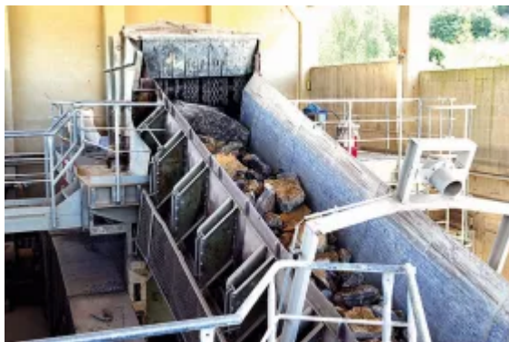
Apron plate feeder for raw material intake to crushing plant.

Industrial minerals are now shipped across the globe in vast volumes demanding efficient logistics to minimise both the cost of transportation and the carbon footprint. The Aumund Group has developed a range of bulk handling solutions at each link in the mineral logistics chain allowing the operator to take maximum advantage of any combination of truck, rail, barge and deep sea shipment.