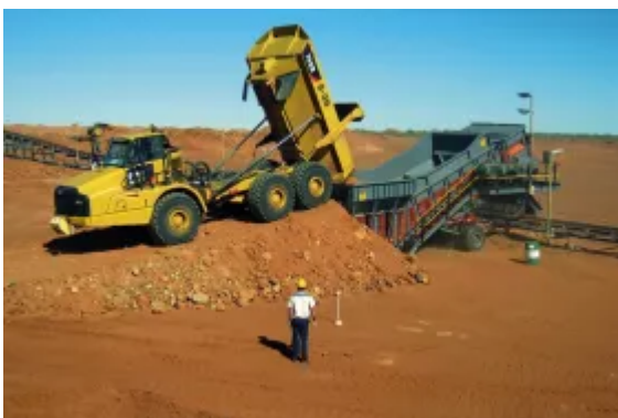
Mobile material feeder feeds overland conveyor in a diamond mine.

From the link conveyors the sized material may be conveyed on conventional fixed or semi-permanent field conveyor equipment to the secondary crusher and final screening station and stockpile. Whilst the link conveyor solution eliminates all truck haulage there is no doubt that for short distances the flexibility of haul trucks is attractive for the operator.