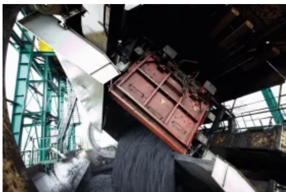
Automated discharge of flat bottom railcar by wagon tippler.

The same general arguments for dust control is applied at the Eco Hopper and the Samson ® feeder based on mitigation at source to save on capital and operating costs.