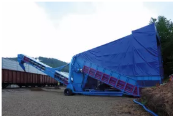
Loading Melafyr (Basalt) via Storemajor to railcars in Poland.

Expanding this concept Samson have recently commissioned three of their new wheeled Material Feeders in a large mining operation in Southern Africa handling as mined rutile sands delivered by ADT achieving an average loading rate of around 1300 tons per hour per feeder. Based on the Berco "SALT" (Sealed And Lubricated Track) chains type D6 these feeders are able to operate reliably under extreme conditions handling highly abrasive ore.