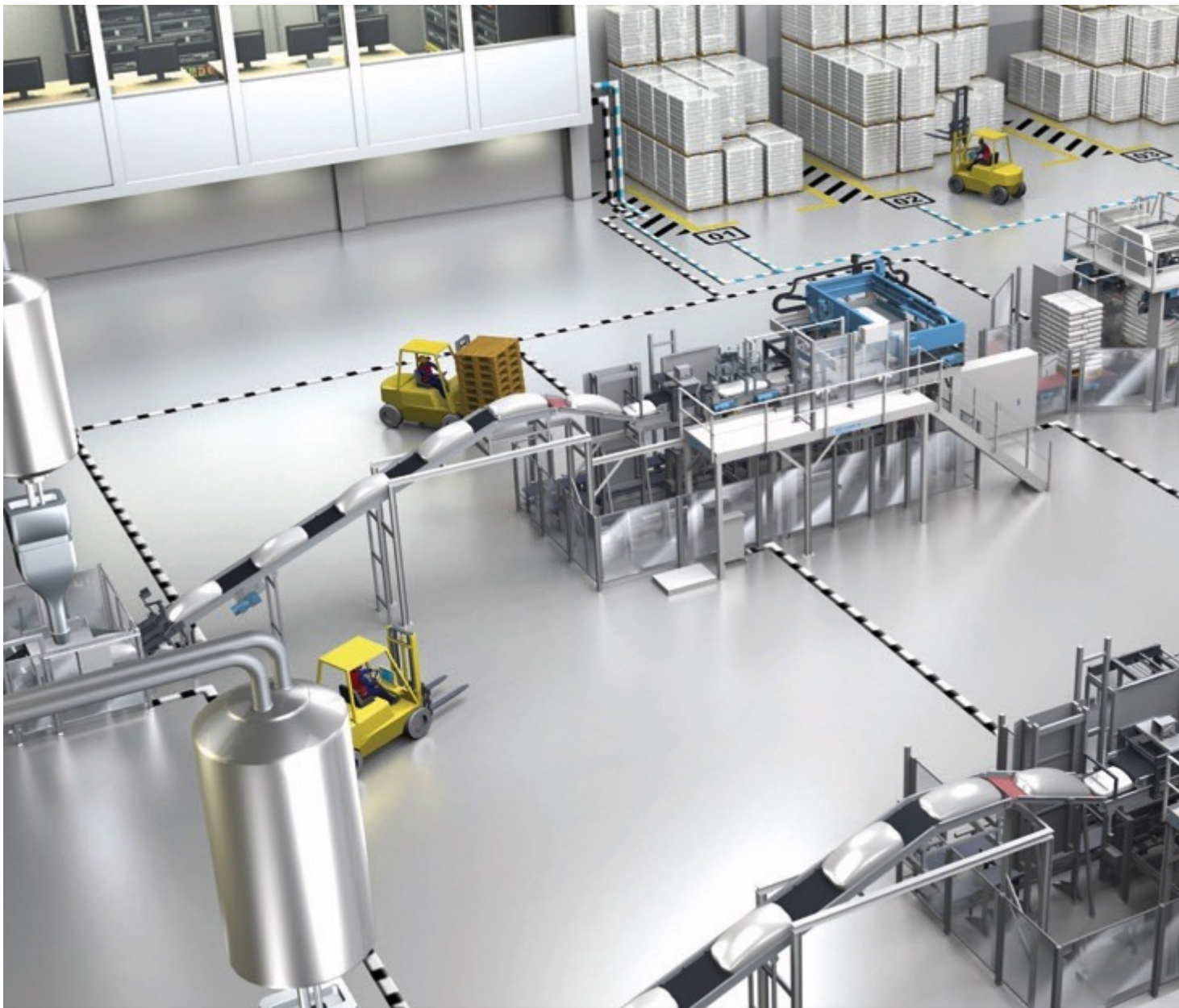
Beumers warehouse management system oversees the entire packaging line.

palletised products has become more and more important. These products must be palletised and filled reliably and securely packed in order to deliver them to the customers without damage. The intralogistics specialist Beumer has expanded its product portfolio with the fillpac filling machine and offers plants and systems for complete packaging lines as single-source provider. The fillpac can be flexibly integrated with existing packaging lines and can be optimally adapted to the customer's conditions. In palletising technology, Beumer provides a graduated and comprehensive spectrum of high-capacity layer palletisers that form secure load units. The geometric precision and the stability of the palletised stacks enable easy storage and ensure secure conveyance to the packaging system downstream.