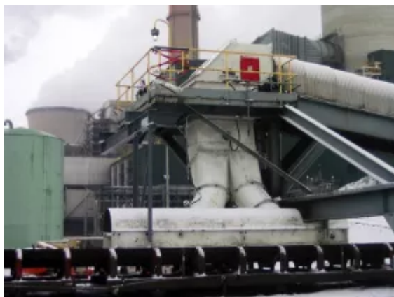
Fig. 1: Modern chute design eliminates plugging and buildup and reduces dust generation in the conveyor load zone.

Modernisation of conveyors in coal mines and coal-fired power plants helps to ensure that the mine or plant is running to their optimum capacities, maximising throughput and producing quality products with as little impact to the environment as possible.