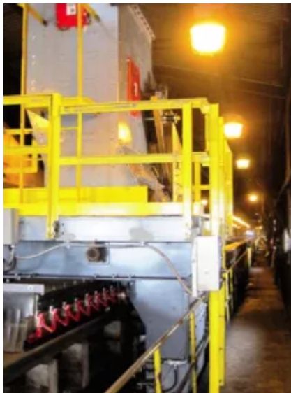
Fig. 5: The newly installed transfer chutes operate with improved coal flow through the tripper system.

The new design improved the flow of the coal and the new combination of internal liners also improved the wear ability of the liners. The combination of the X-Wear MDX liners, a combination of ceramic cylinders encased in rubber, for the impact area and the chromium carbide overlay plate (double pass and polished) was the answer to the sliding abrasion issues prior to the new design.