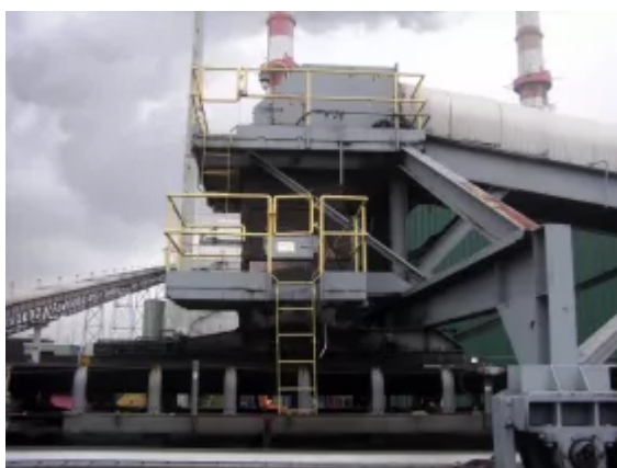
Fig. 2: The old chute would build up and plug with coal fines that stuck together when in wet coal or freezing conditions.