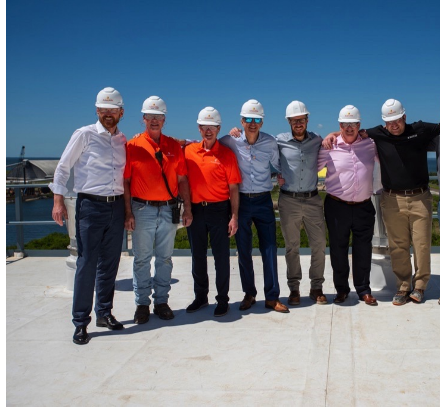
Ardent Mills and Bühler leaders pose high atop the state-of-the-art mill.

The construction on the Port Redwing facility began in 2019 and was completed in March 2022. The milling project comprises of two milling units (with the ability to produce 750 tons per day and 300 tons per day respectively), and Ardent Mills has kept the growth of the market in mind, adding space for a third mill in the future. The Port Redwing mill produces all-purpose, whole-wheat, high-gluten, cake, and bread flour. Bühler supplied the cleaning section, the flour mill, the finished product storage, the batch mixing system, engineering, installation,