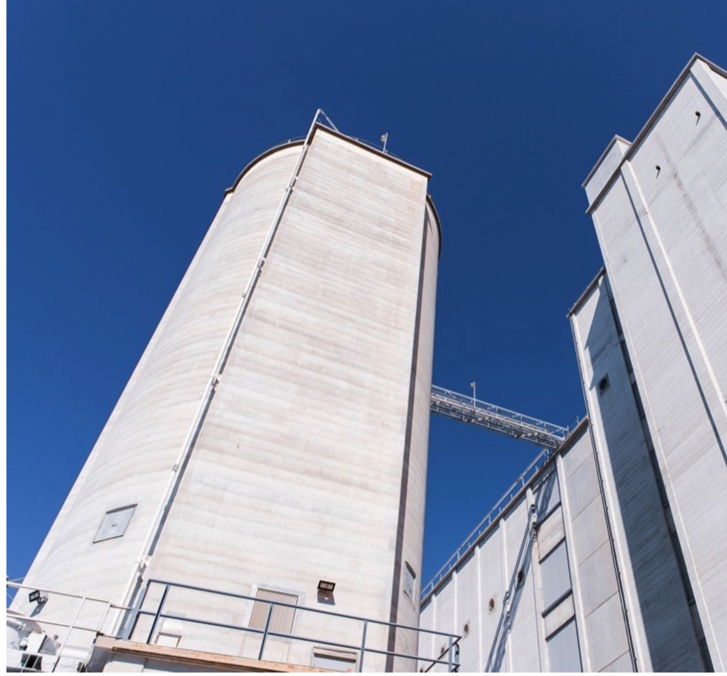
Ardent Mills new Port Redwing facility in Gibsonton, Florida, stands tall among the world's mills.