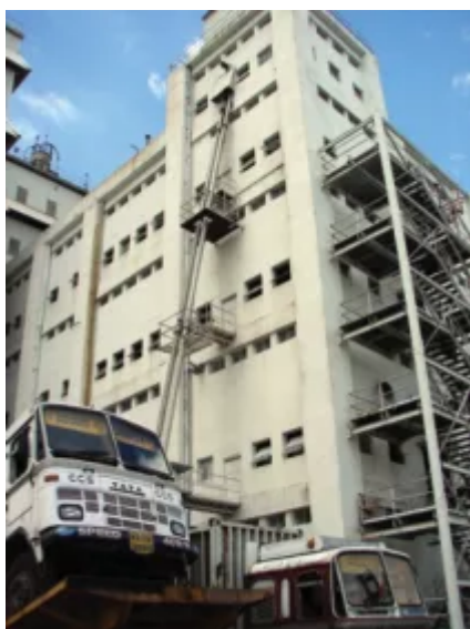
Fig. 1: The Hapman tubular drag conveyor shown above is installed at a PET resin manufacturer in Haldia, India. The conveyor replaced a

While pneumatic conveying has advantages in specific applications, a totally enclosed tubular drag conveyor can offer similar advantages, while also mitigating material degradation and separation, maintaining low energy consumption and reduced explosion risk.