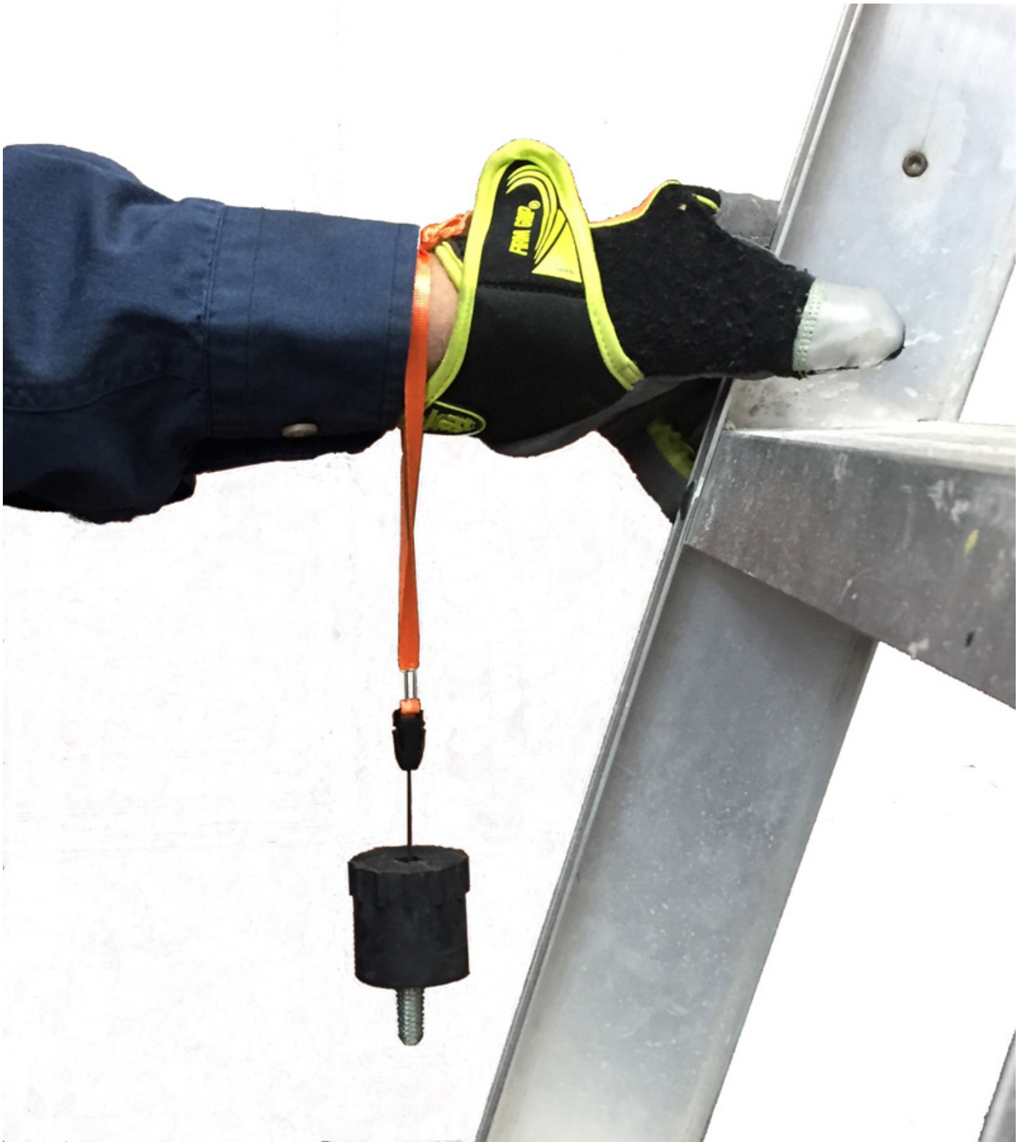
Figure 2: Pre-loaded Keeper with breakaway lanyard

While in most cases being struck by a falling fastener isn't lethal, OSHA calculates the direct cost to the employer for a lost time injury due to a contusion is over USD27,000. 1 If a worker is just one floor up and drops a fastener, it can take several minutes to retrieve the fastener and try again. Even at a total labor cost