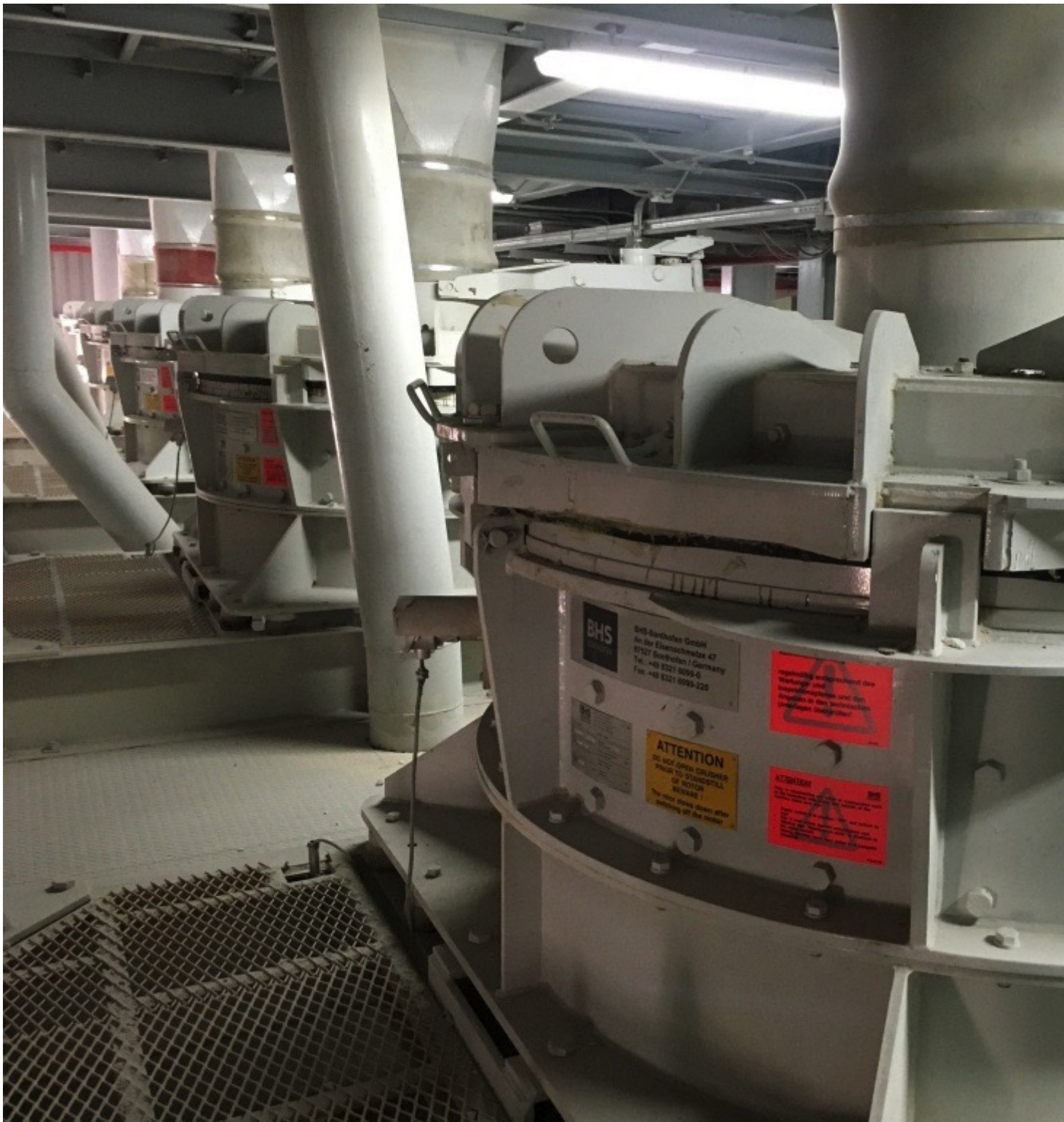
Twelve RPM-type rotor impact mills are operating at Siam Mortar.

These properties have contributed to the fact that a large number of dry mortar plants worldwide are operated with BHS machines. One of the most important sales markets is Southeast Asia. Dry mortar in Southeast Asia is often not only used as plaster for outdoor and indoor surfaces or as masonry mortar or screed, but rather especially for fine finishing plasters. In contrast to Germany, colored plasters are frequently used in Thailand, as are rough plasters, which have a