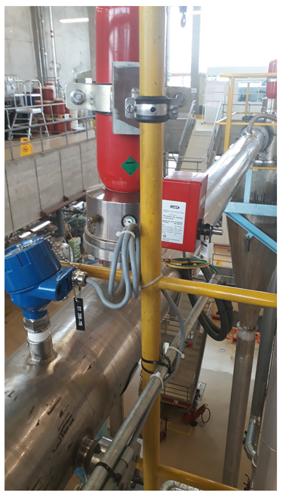
ProSens - Application.

A manufacturer of processed foods refines dairy products. The dust-laden exhaust air produced during the manufacturing process is extracted and cleaned by industrial filter systems. With increasing wear of the filter elements, the dust content in the exhaust air can rise and lead to an increased environmental pollution. A continuous dust measurement (mg/m³) is even officially prescribed