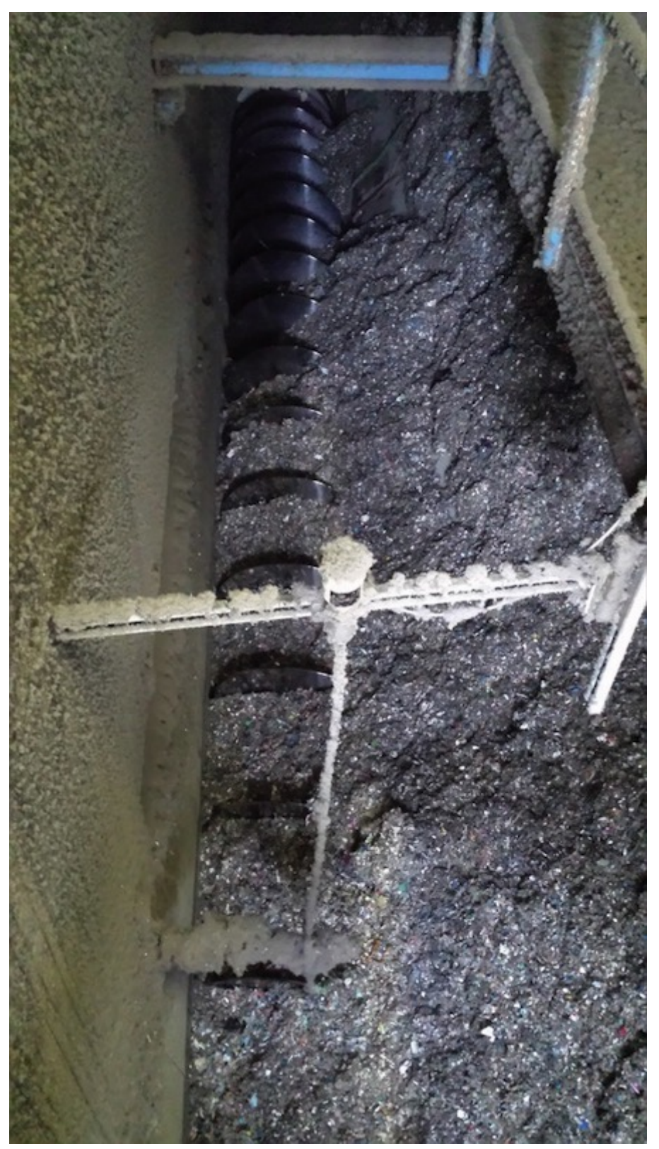
Fill level measuring probes and other measuring technology monitor the automated processes.

With the second system, the calciner can be fed with more coarse alternative fuels, such as tyre derived fuel or the fuels described above, but in a more coarse state. They are generally less processed, contain three-dimensional particles and therefore require more time to burn out than for example the more intensively