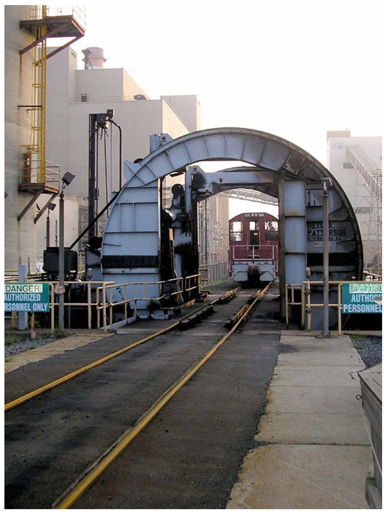
A train is approaching the railcar dumper at an iron ore smelter.

Man has been mining metals and minerals since prehistoric times. The world's oldest known mine site is located in Swaziland in Africa, where the first mining of metals was recorded via carbon dating as 43 000 BC. Mining of metallic minerals occurred in ancient Egypt, Greece and the Roman Empire, and metals such as