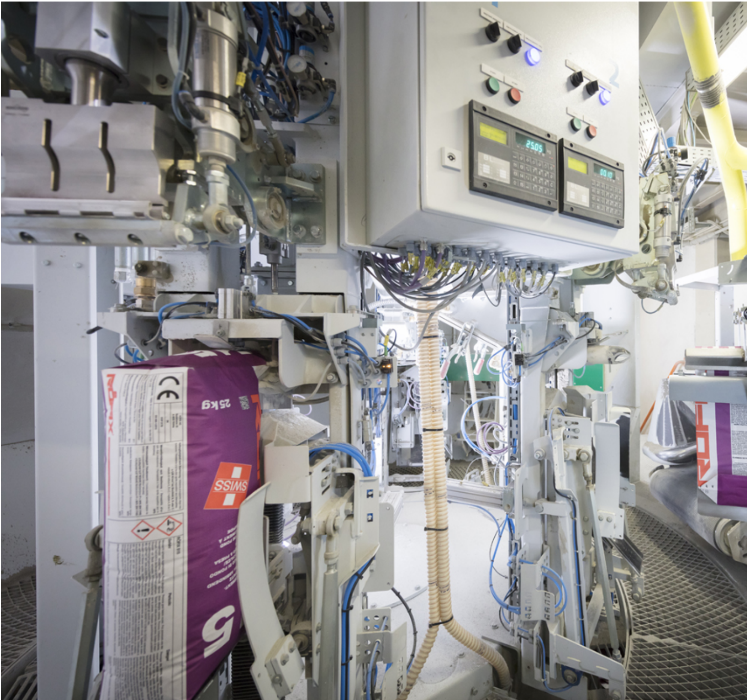
Picture 4: ... and the new BEUMER bag placer. This helps the operator to further increase performance.

Filling process: not too much, not too little Due to the wide range of manufactured building materials, BEUMER Group installed a BEUMER fillpac R filling machine that operates according to the air filling principle. The bags are weighed during the filling process. The BEUMER fillpac is equipped with an electronic calibration-capable weighing unit. It ensures that the bags are always filled with the same amount of material. A special software enables filling spouts and scale to constantly compare weights. By using ultrasound to seal the bags, a very clean and efficient technology, the system can ensure optimal results. It also