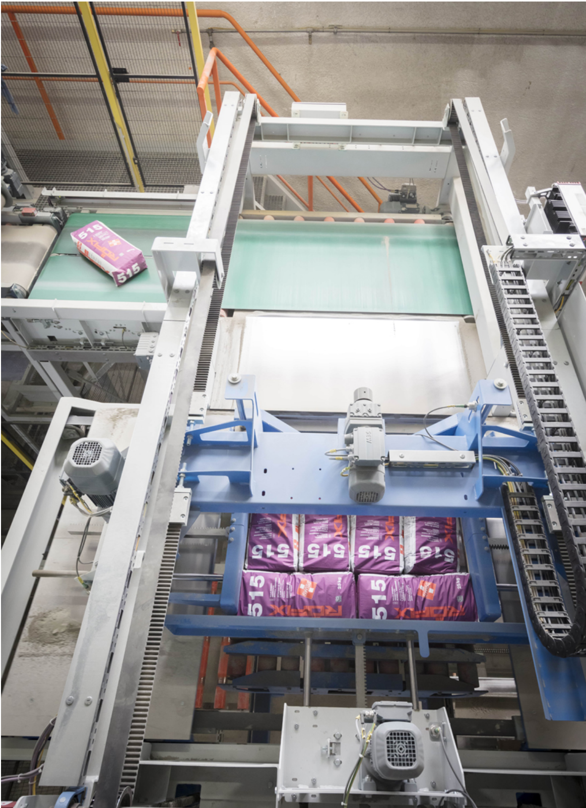
Picture 6: For this, BEUMER Group installed a BEUMER paletpac layer palletiser.

Packed fast and safely The finished bag stacks are transported over roller conveyors to the BEUMER stretch hood packaging system . "It is particularly easy and safe to use," explains Sieleman . In order to facilitate the work for the