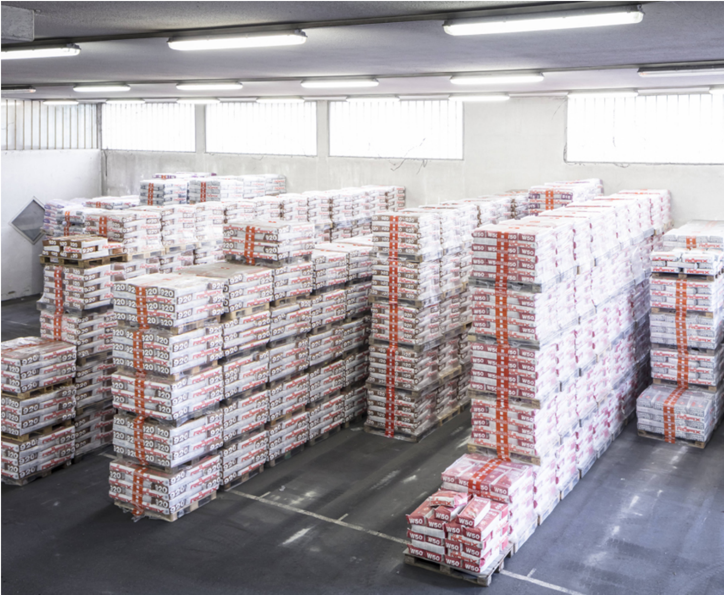
Picture 8: Masonry mortar, renderings, paints, coatings and unbonded screeds: different products are bagged, palletised and packaged quickly and reliably. Now Röfix can

Everything under control The system supplier has equipped this line with the BEUMER Human Machine Interface , which makes it easy and simple to operate. The operators are provided with an easily understandable and intuitive interaction concept, enabling them to define the same efficient working sequences for all machines. Displays help visualise how and where to make the settings. The user can for example call up video sequences that show the changing of the film roll and the film knife. For other set-up work like the bag correction on the BEUMER paletpac, the operator panel includes graphics and step-by-step instructions.