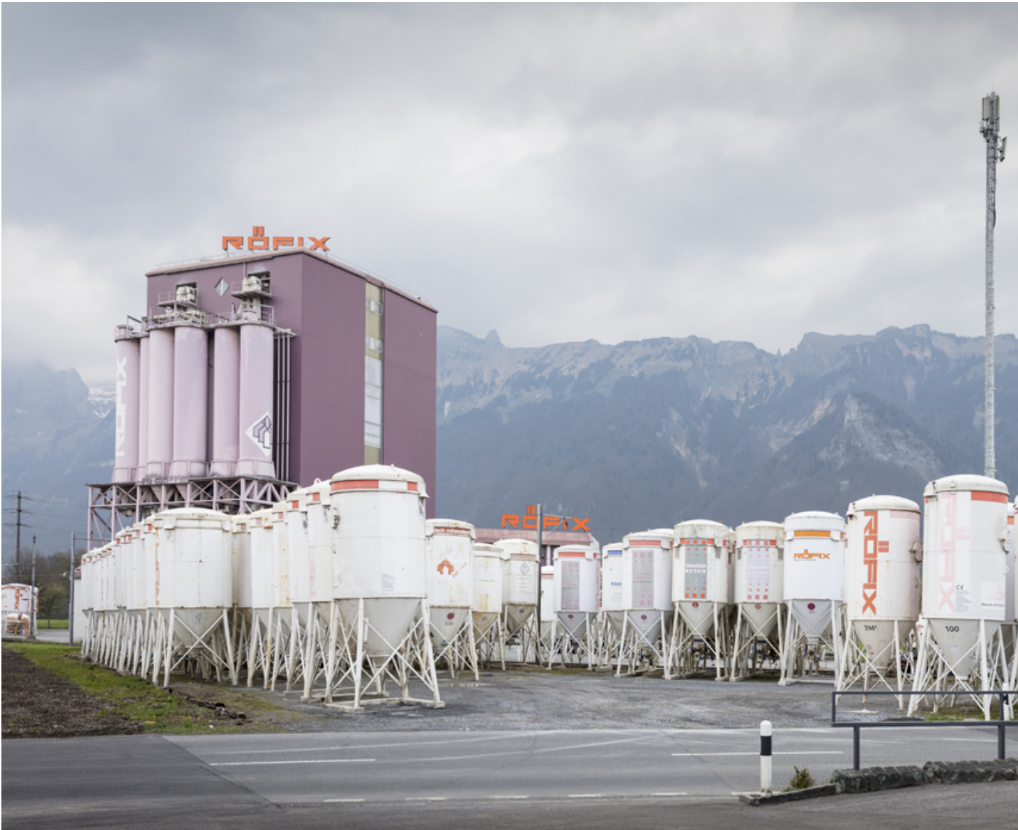
Picture 1: Overlooking the mountain panorama: Sennwald is home to one of Röfix's five branches in Switzerland. The manufacturer needed a flexible packaging line for different building materials.

A mountain range, characterised by the summits of the Chrüzberg, Stauberen and Hoher Kasten, dominates the panorama of the extensive Rhine plains. Here in Sennwald in the canton of St. Gallen, nature enthusiasts, hikers and bikers enjoy the forests, meadows and winding paths. The Austrian building materials manufacturer Röfix, member of the Fixit Gruppe, has one of its five Swiss locations in this picturesque town with its approximately 5,000 inhabitants. "We are manufacturing our entire product range here," describes Josef Sennhauser , CEO of Röfix , Switzerland. "Among the some 200 different building materials are fine plaster, different types of concrete, masonry mortar, screed and adhesives,"