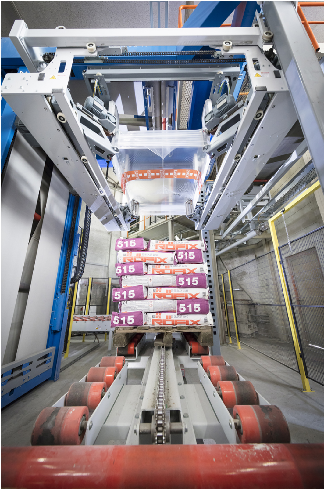
Picture 7: The BEUMER stretch hood A places a stretch hood over the palletised products. This increases load stability. And it displays the products efficiently which means optimal brand presentation.