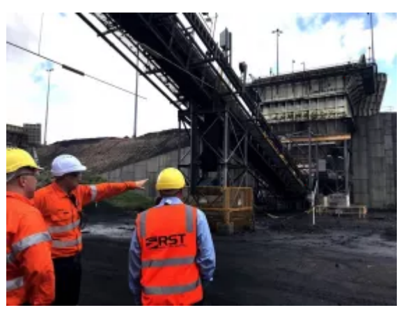
RST Solutions has developed advanced chemistry to achieve optimum DEM.

there is a high potential that the amount of water will affect the quality of the material and cause handling problems, not just at the mine, but throughout transportation and storage, affecting product quality for the end user.